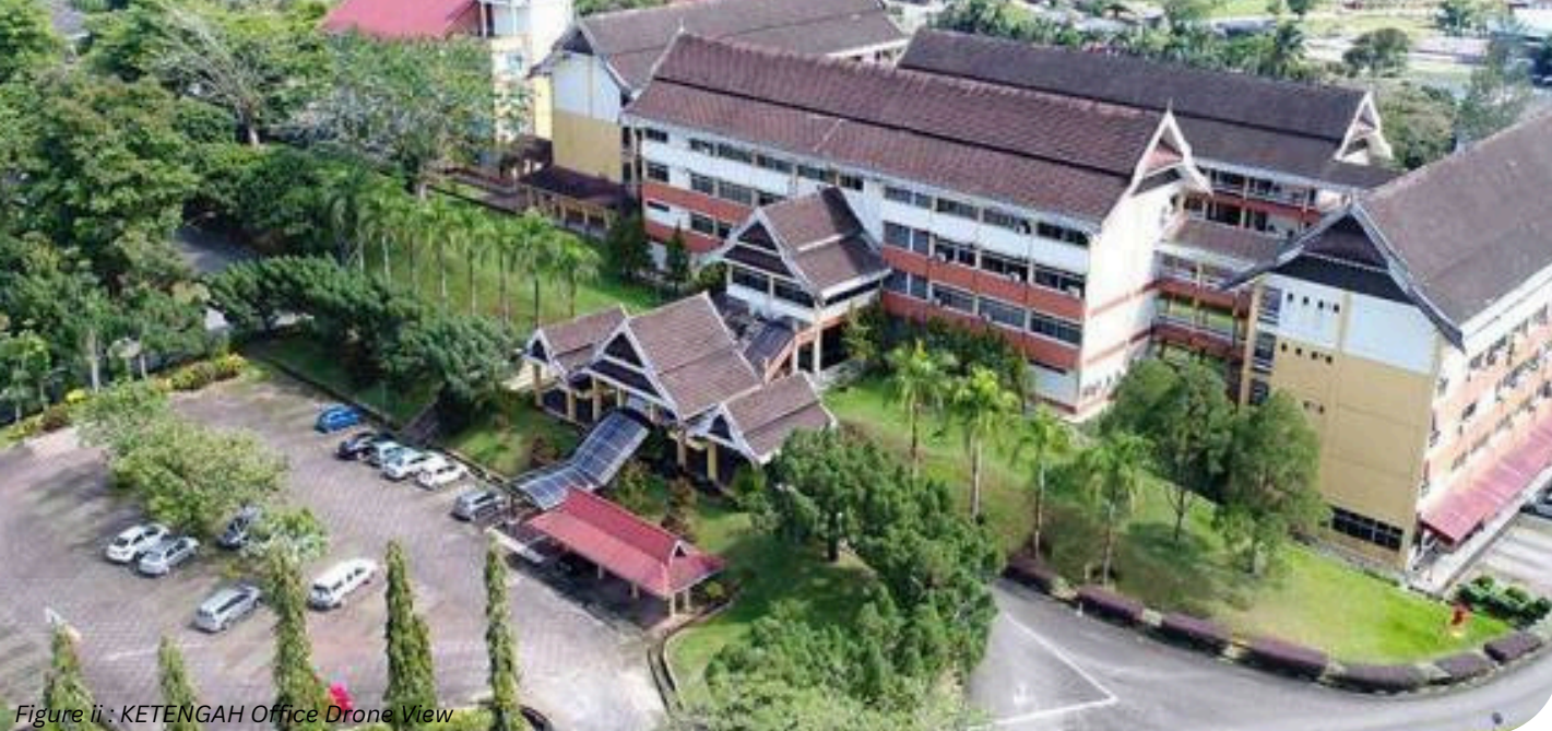
Figure ii : KETENGAH Office Drone View