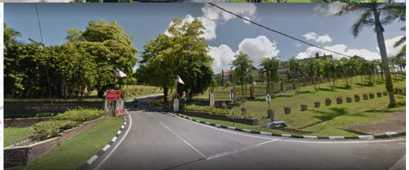
Figure v : KETENGAH Office (Entrance)