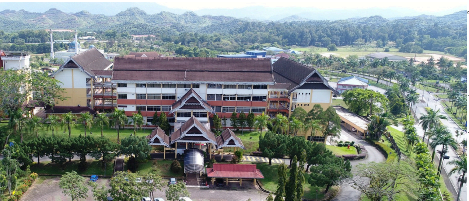
Figure iv : KETENGAH Office (Drone View)