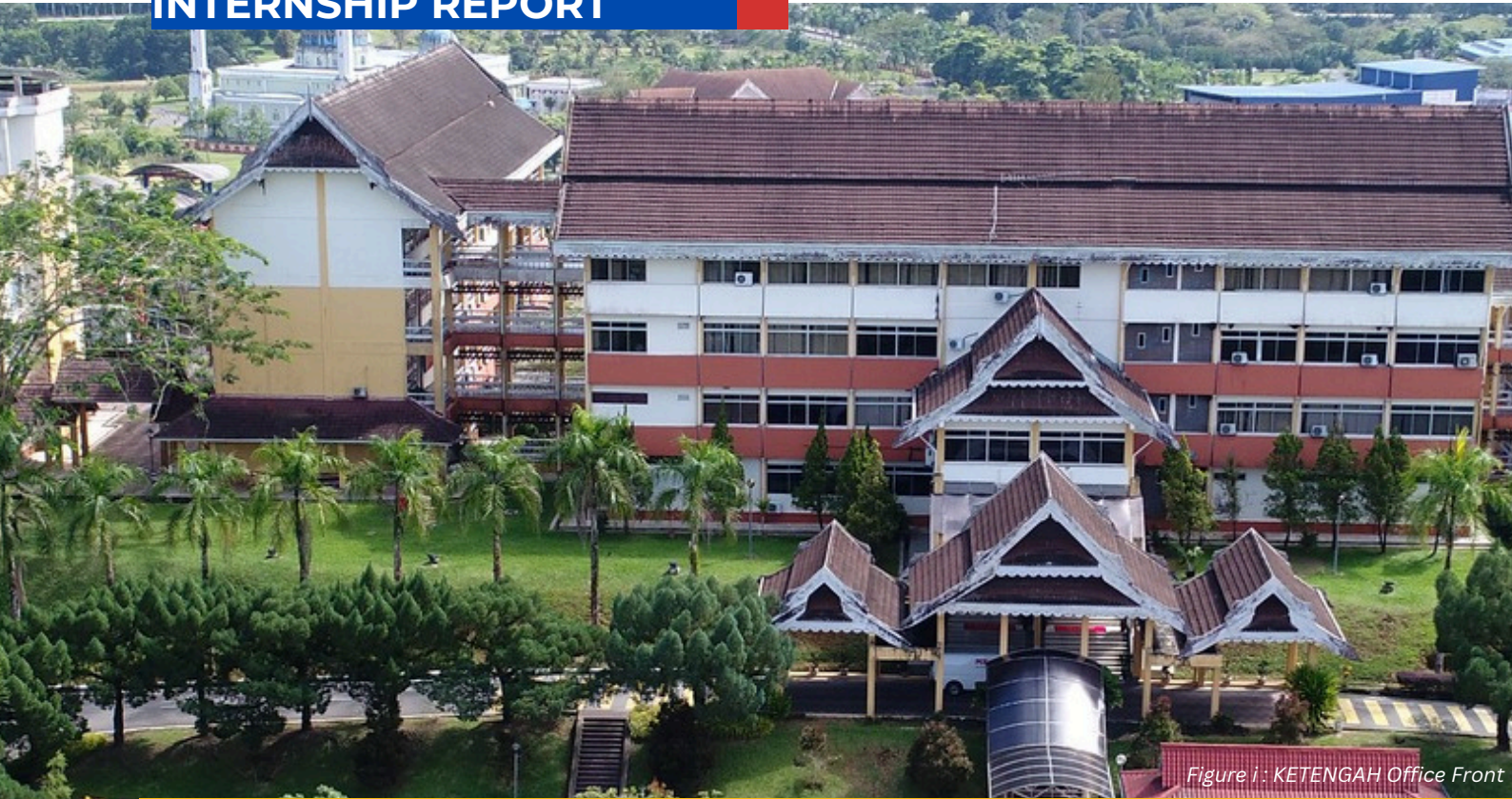
Figure 1 : KETENGAH Office Front