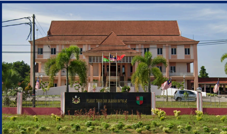
Pejabat Tanah dan Jajahan Machang (PTJM)