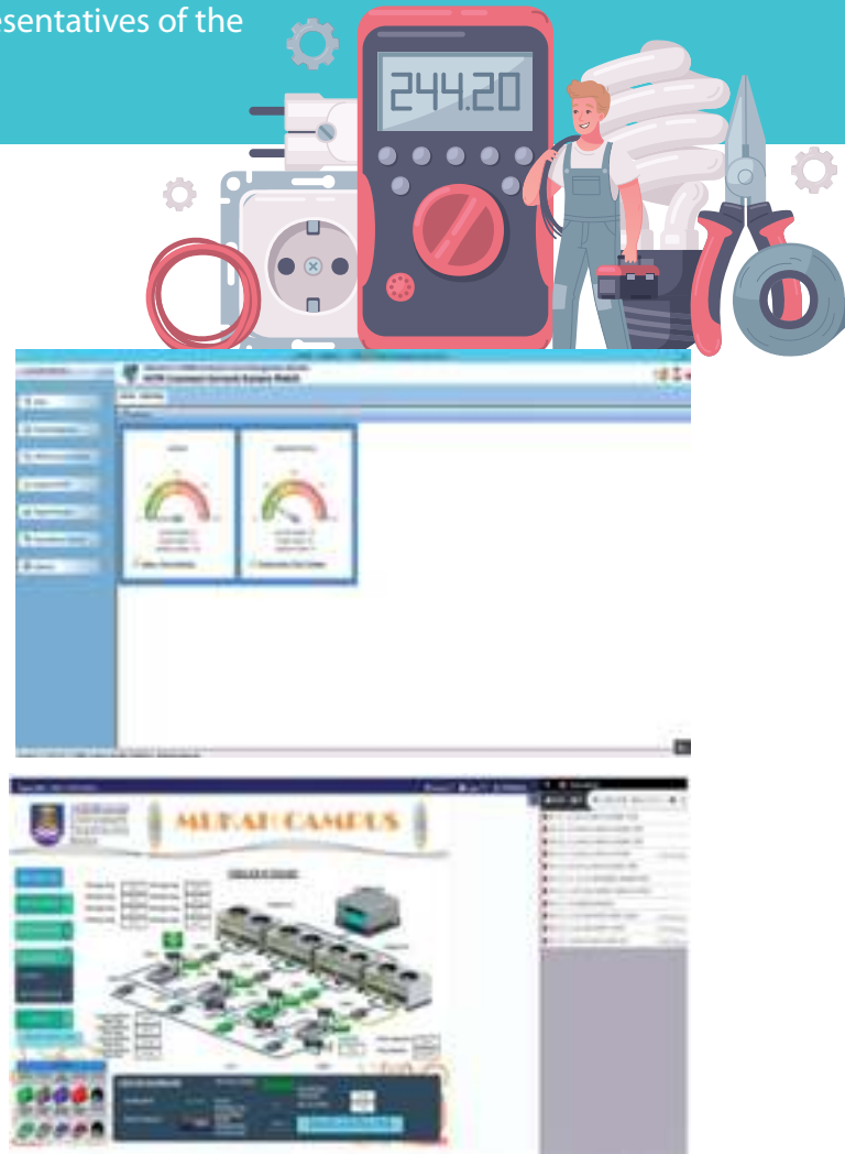
Figure 6.4 Facility Management System Using Tomms Dan Building Management System Software

Computerized systems for facility and building management are used to monitor electric usage in the buildings. For facilities management, a system known as Tomms is used to help the Facility Unit plans more effective and sustainable planning, to be in line with the Facility Management System (FMS) approach (Figure 6.4). For building management, UiTM Sarawak uses Pegasus software to monitor and control building services such as mechanical ventilation systems, lighting and fire prevention systems. A smart meter at the main switch is also installed to obtain electricity consumption readings in each building to monitor electricity consumption.