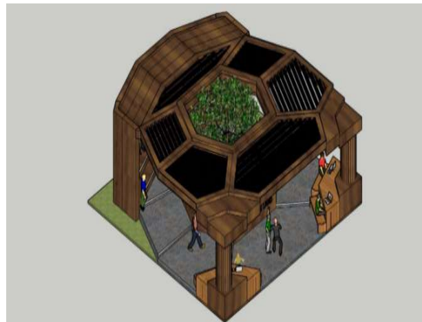
Figure 5: The 3D view of Everlasting Land