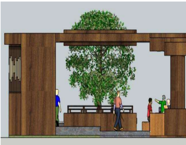
Figure 4: The side view of Everlasting Land