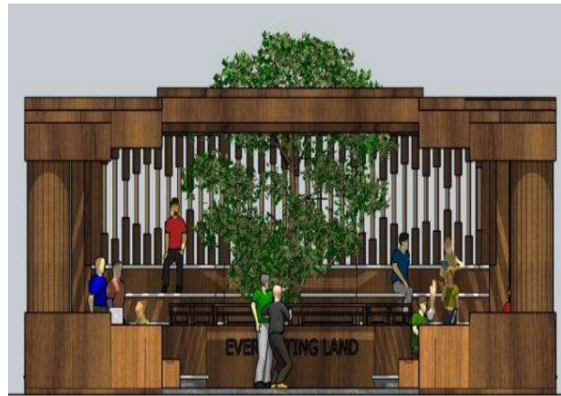
Figure 3: The front view of Everlasting Land