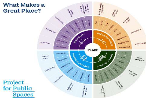
Figure 1: The four elements of great places: Uses & Activities; Comfort & Image; Access & Linkages; and Sociability.