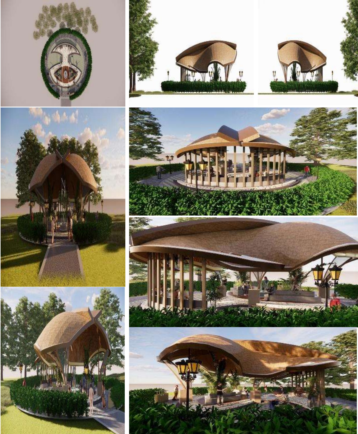
Figure 1: Tentang Bulan

pavilions provide shelter from the elements and serve as rest areas for individuals seeking refuge from the sun, rain, or wind. They offer a comfortable and accessible space for people to take a break and relax outdoors.