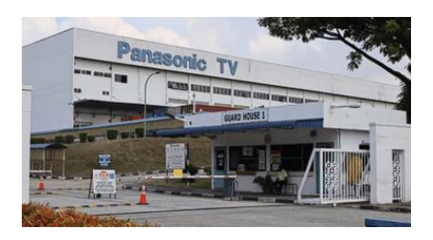
Figure 1.1 Perspective view of partner company ATLANTIC PROJECT MANAGEMENT SDN. BHD.