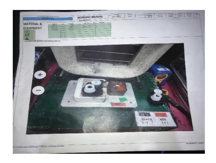
Figure 2.1 Working Manual of soldering

motor wires attached to the PCB board. The time it takes to solder it is under 5 seconds to avoid damage to the wire or the PCB board.