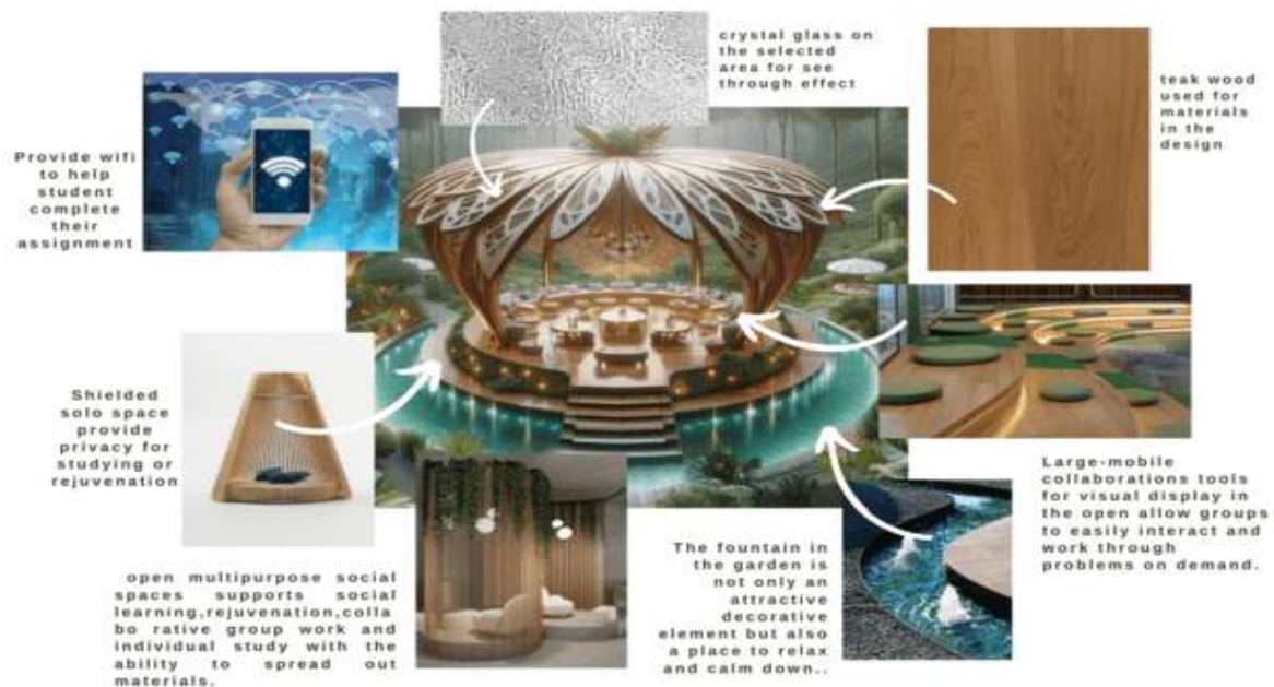
Figure 1: Design process

This project will be divided into two stages, the first of which involves studying the target user, designing the project based on the chosen concept, and analyzing the design elements and user preferences for consideration. The second stage involves developing the design, sketching the idea for the project to provide various facilities, and determining the final option based on the research conducted in the first stage.