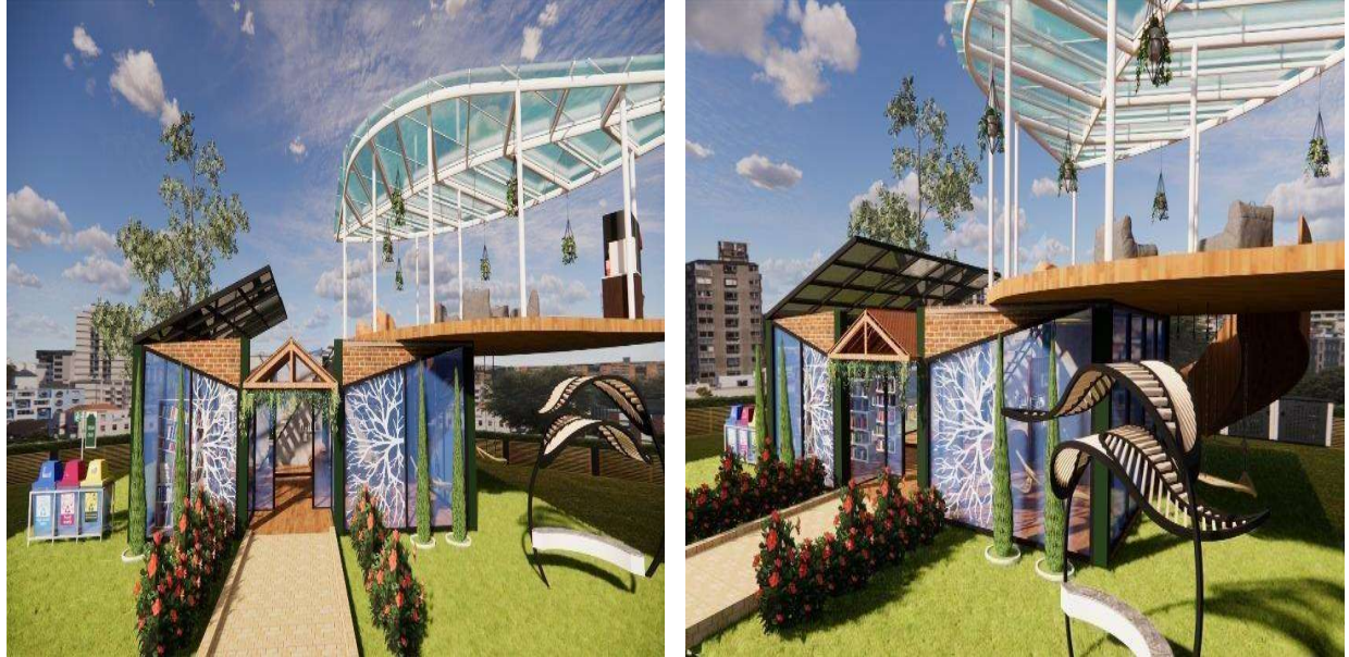
Figure 1: Vein Student Hub

in sustainability and renewable energy. By implementing rigorous cleanliness protocols and maintenance schedules, the pavilion ensures a hygienic environment conducive to learning and socializing. Regular sanitation of high-touch surfaces, provision of hand sanitizing stations, and adherence to health guidelines mitigate the risk of illness transmission, instilling confidence among students.