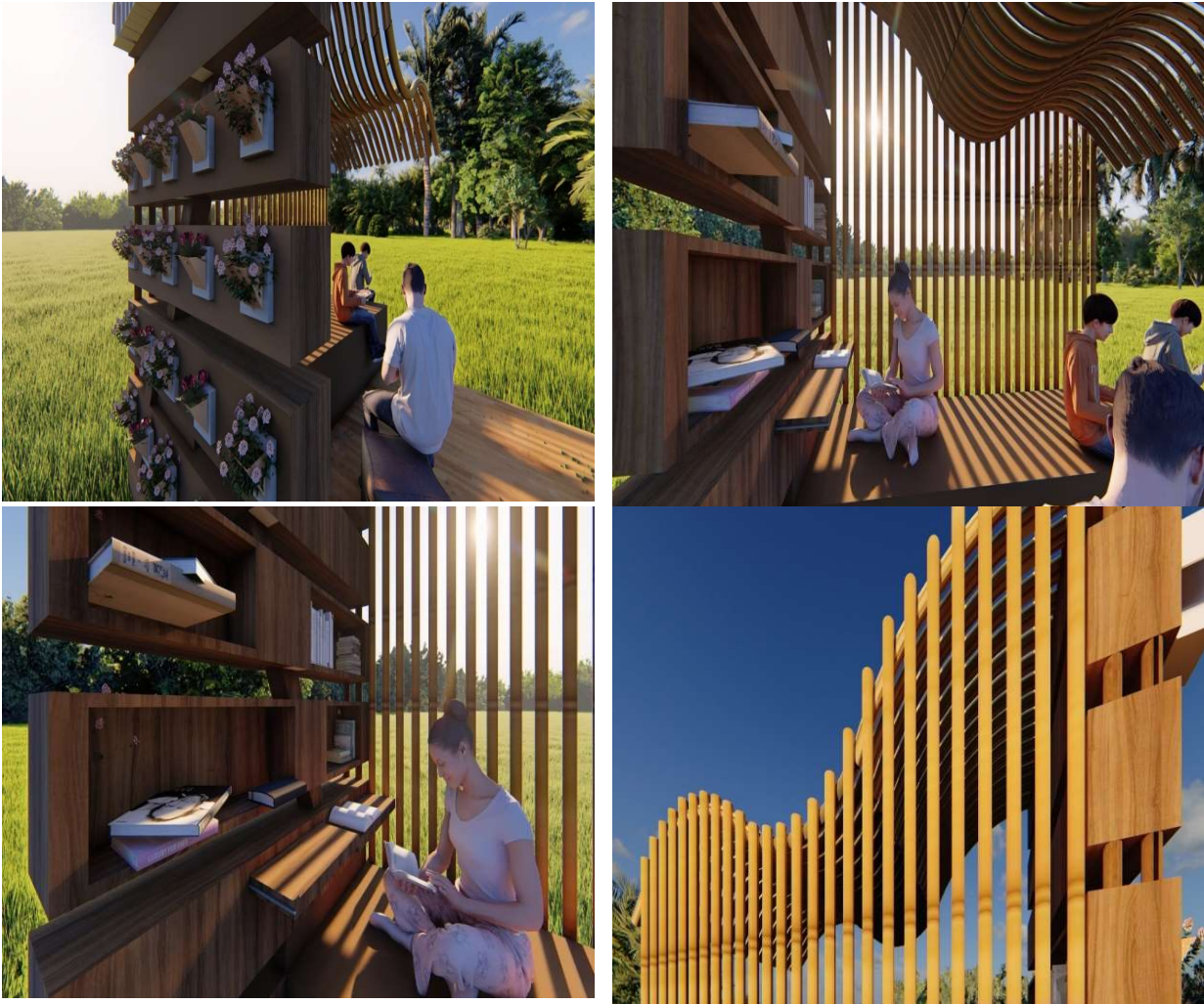
Figure 1: The Timba Nook