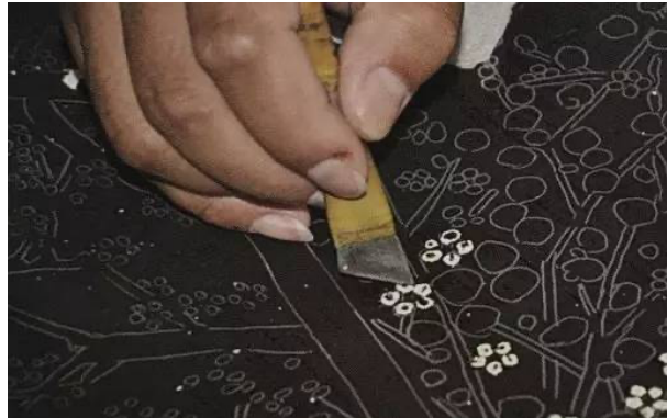
Figure 6 Cuts

In the creation of eggshell inlay artwork, the shape of the eggshell fragments has this diversity of needs, while the eggshell has thin and fragile characteristics; given these aspects, artists have developed many fine-cutting tools (Figure 6). These include miniature carving knives, scrapers, fine scissors, miniature scissors, and other tools, which are sharp and small enough to allow for precise cutting and fine adjustments on the eggshell. This requires the sharp edges and compact size of the tools, which can be used to adjust the position of the eggshells in the picture or to remove the excess better, creating complex geometric patterns and smooth curves and enriching the art form of the work with efficient cutting tools (Zhou, 2023). The cutting tools efficiently enrich the art form of the work, ensuring that the eggshells appear in the form required for the job.