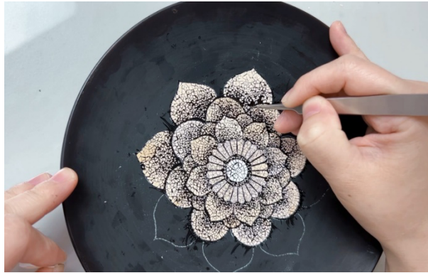
Figure 7 Tweezer

with patterns and details. In modern practice, the toothpick is also used as a sharp tool with tweezers. The selection of special tweezers is also very particular, often using stainless steel or corrosion-resistant materials to ensure long-term operation stability and durability. Precision tweezers require the artist to have extraordinary patience and excellent hand-eye coordination to ensure that each piece of eggshell is accurately embedded, achieving the fineness of the pattern and the smooth effect of the edge, highlighting the exquisite micro-technology.