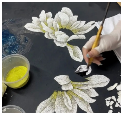
Figure 8 Soft brushes

Once the eggshells are prepared, it is time to create the picture. In the process of bonding the eggshells to the lacquer, different types and sizes of soft brushes can be used for various sizes of eggshells (Figure 8). In the process of inlaying eggshells, a layer of lacquer will be applied to the substrate (e.g. wooden boards, lacquer trays, or other material surfaces). After the lacquer is half-dried or suitably dried, the pieces of eggshells will be processed, and the lacquer will be brushed evenly onto the pasted surface of the eggshells with soft brushes to minimise the wastage of materials to ensure the flatness and fit of the eggshells. Subsequently, after several painting, grinding, and polishing processes, the eggshell and lacquer can be perfectly integrated, presenting a rich and delicate visual and tactile experience.