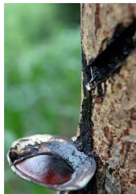
Figure 4 Brown Lacquer Liquid

The newly collected raw lacquer is mixed with oil impurities, thus a fine gauze or screen is also needed for the initial sieving to remove the large impurities (Cheng et al., 2022). The filtered lacquer is then placed in a cool, ventilated, and dry place for some time so that the heavy impurities will settle at the bottom, and the cleaner lacquer will appear on the upper layer to ensure the lacquer's purity and lustre. Subsequently, the purified lacquer will be heated and boiled; this time, the temperature will generally be controlled at (60-80 °C); the temperature is too high or too low to make the quality of the lacquer decrease. In constant stirring, the evaporated part of the water powder and solvent is the lacquer in the unstable components for polymerisation and purification. At the same time, this process can also remove the odour of the lacquer, making the lacquer purer and more transparent. Some lacquers also need to add an appropriate amount of oil auxiliaries to improve the performance of the lacquer, such as enhancing the gloss, increasing flexibility, accelerating the drying, and so on. Subsequently, the boiled lacquer liquid in natural conditions gradually matures through the role of air and sunlight