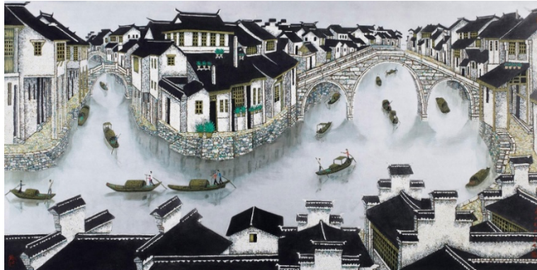
Figure 1 Qiao Shiguang 《Jiangnan Water Town》

the present day and is still a source of artistic innovation. Whether it is for private space decoration or public art display, it shows excellent adaptability and aesthetic expression, injecting more fresh inspiration and vitality into lacquer art, and ensuring the relevance and practicality of this ancient technique in contemporary society.