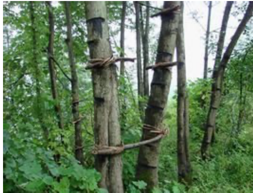
Figure 2 Lacquer tree

best part of the trunk can be cut to extract the milky white sap rich in lacquer phenol. Raw lacquer has an adhesive force, is decorative, protective, etcetera. The integration of primitive means of subsistence, and then integrated into the utility of appliances, injected into the human aesthetic experience and emotion, the birth of lacquer, constituting a unique Chinese lacquer civilisation, unique Oriental charm, creating a lacquer culture development of the first river (Ma, 2021). However, it is essential to note that raw lacquer contains lacquer phenols, which may cause allergic or even toxic reactions for some people (Liu, 2024). Therefore, it is necessary to take precautionary measures during the harvesting of raw lacquer and the production of lacquerware, depending on the situation.