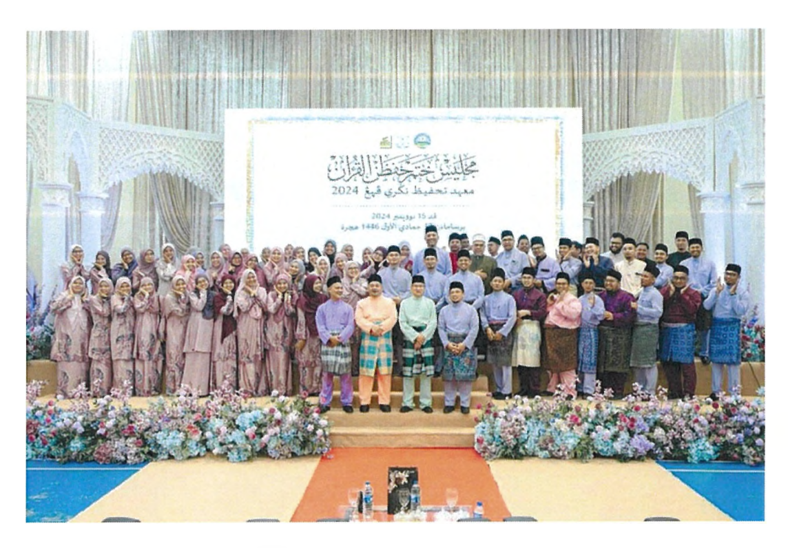
Figure 3: Majlis Khatam Hafazan Al- Quran MTNP 2024