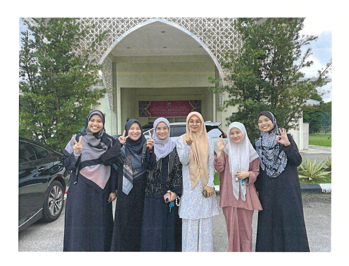
Figure 6: Carom sports competition 2025