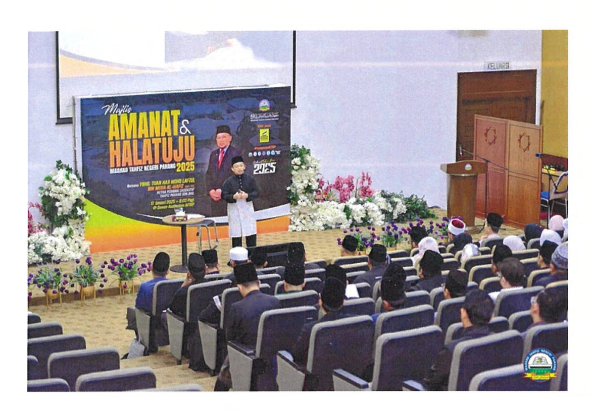
Figure 8 : Majlis Amanat & Hala Tuju MTNP 2025