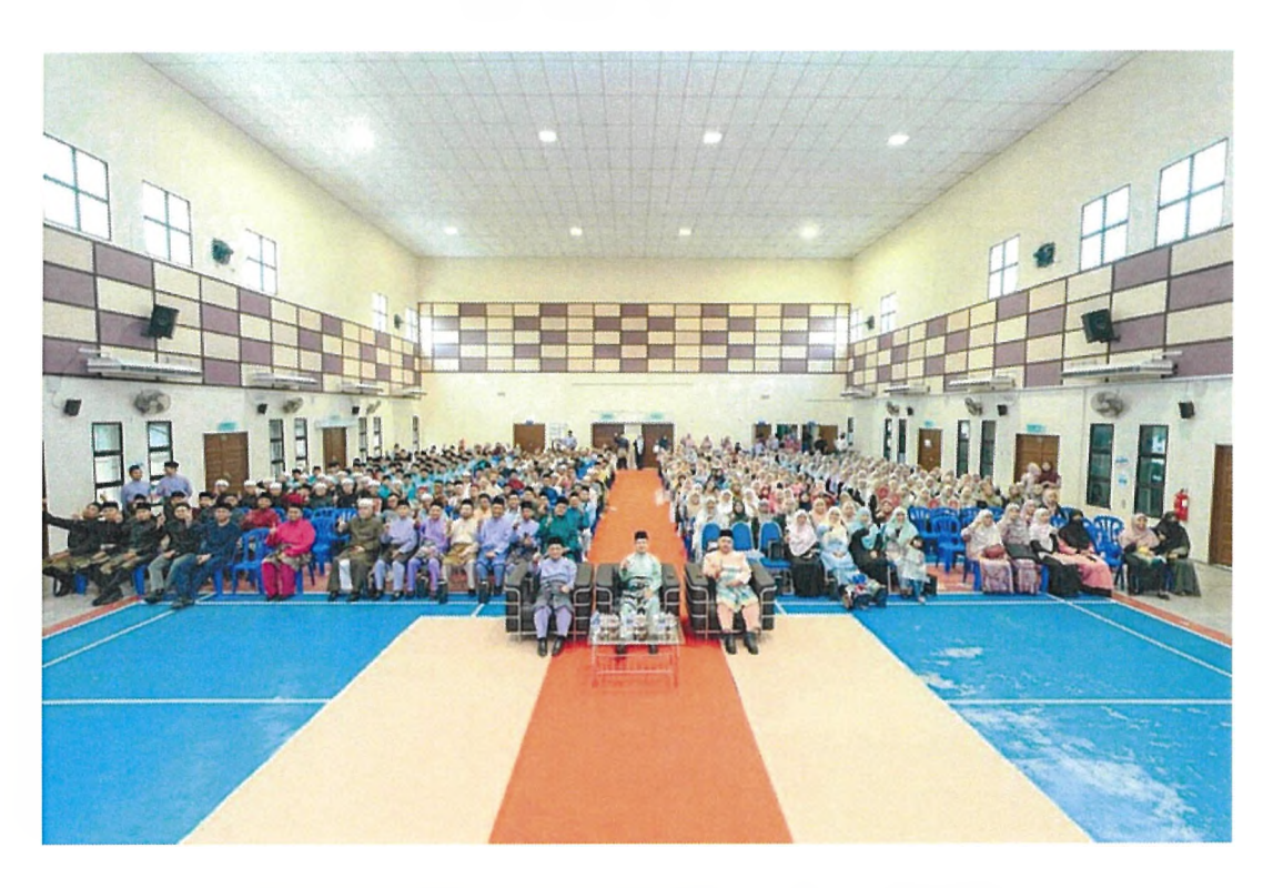
Figure 4: Majlis Khatam Hafazan Al- Quran MTNP 2024