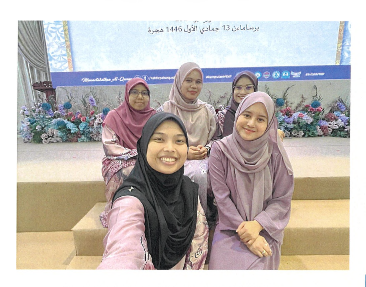
Figure 7: Majlis Khatam Hafazal Al-Quran MTNP 2024