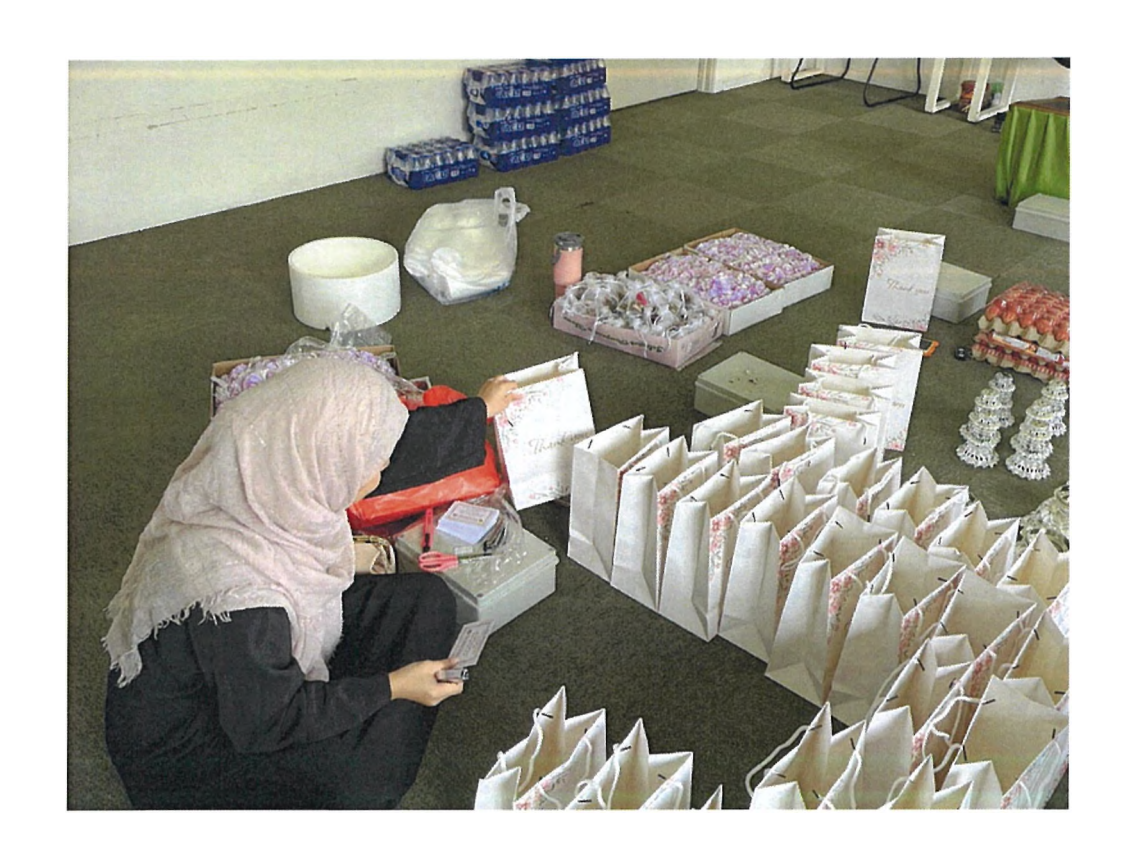
Figure 5: Preparation for Majlis Khatam Hafazan Al-Quran MTNP 2024