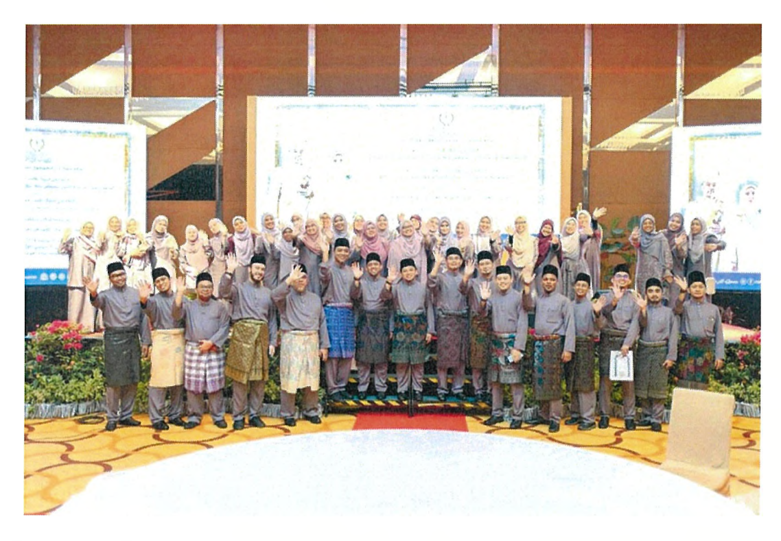
Figure 1: Majlis Pengurniaan Anugerah Kecemerlangan Maahad Tahfiz Negeri Pahang 2024