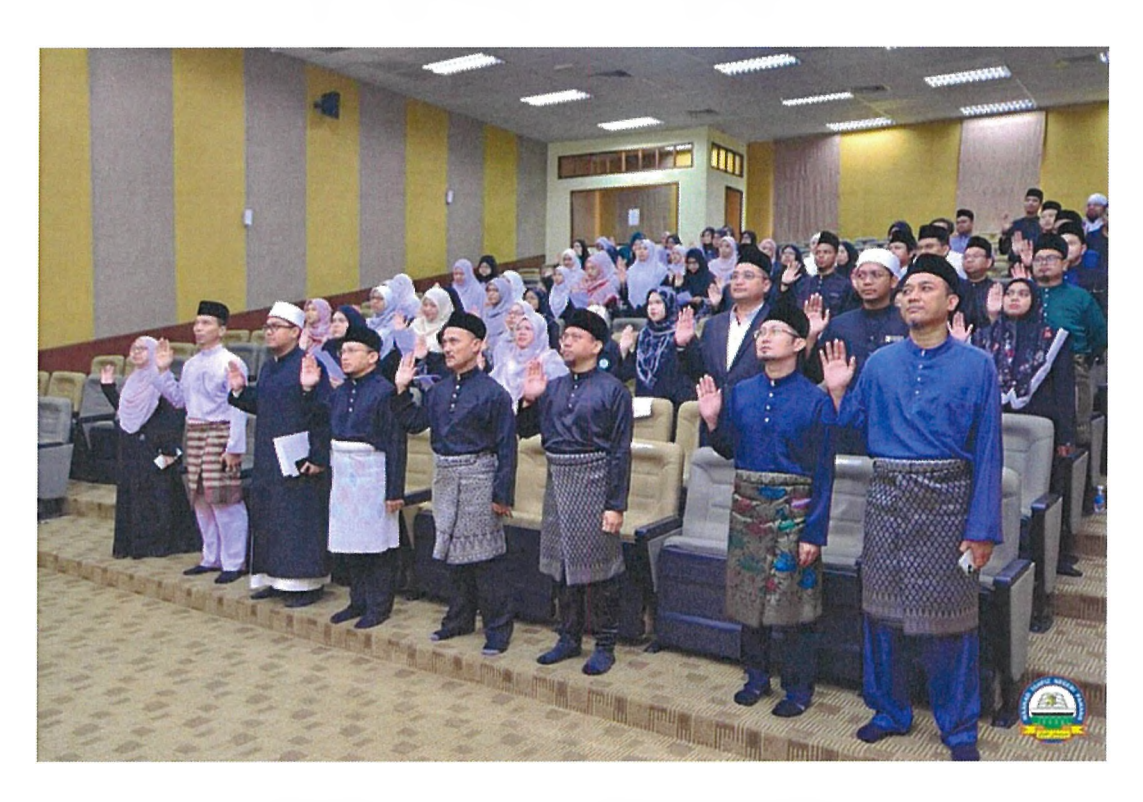
Figure 9: Majlis Amanat & Hala Tuju MTNP 2025