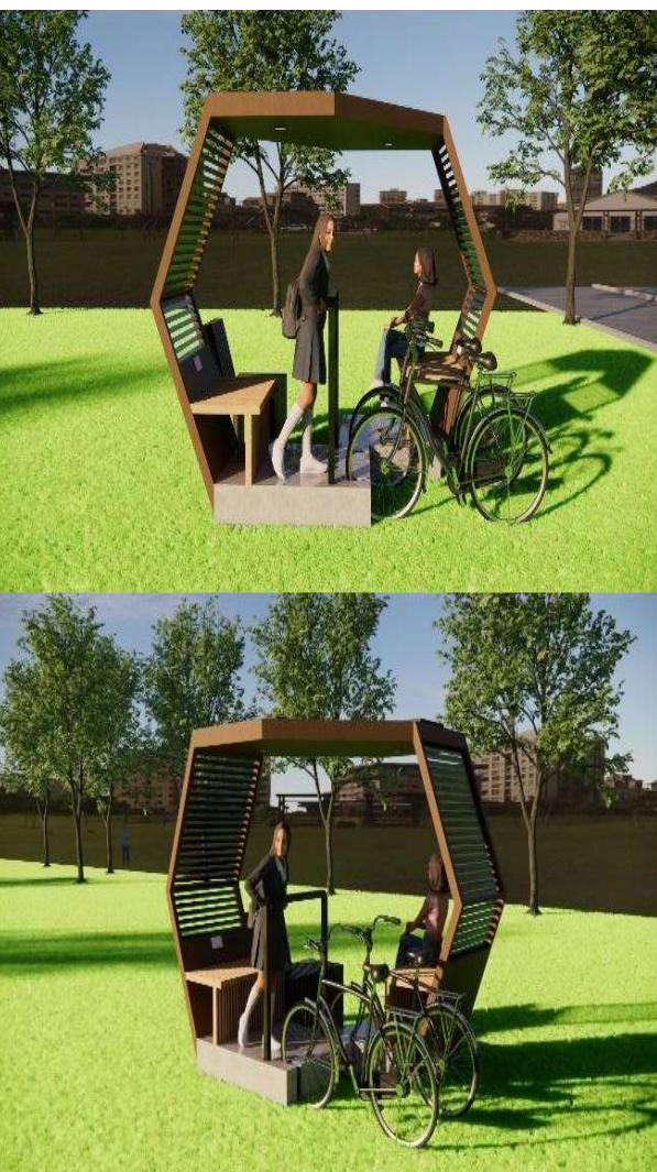
Figure 1: The Cozy Coves