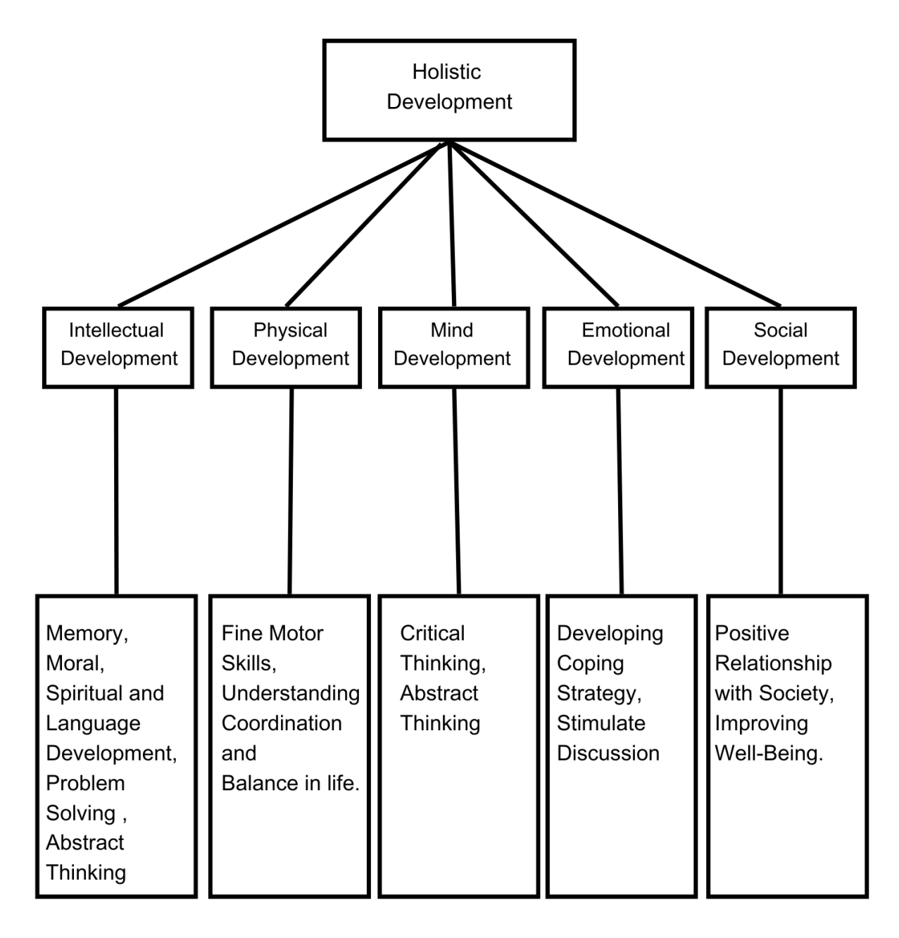
Figure 2. Holistic Development (adopted: Channawar, 2023)

Holistic development as shown in Figure 2 is an approach that takes into account the comprehensive advancement and welfare of an individual, covering physical, emotional, social, cognitive, and spiritual aspects. This perspective acknowledges the interrelated nature of different facets of human development and underscores the significance of addressing each dimension to nurture a fully-rounded individual.