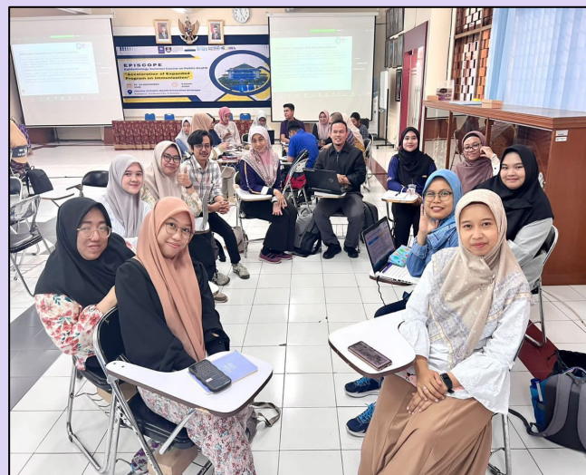
Engaging small group discussions drive collaboration on immunization challenges

Recognising the gravity of this issue, both Malaysia and Indonesia have expressed deep concern. In a collaborative effort to address and mitigate these challenges, Fakultas Kesehatan Masyarakat, Universitas Airlangga (UNAIR) has organised a summer course. This initiative provides an opportunity for domestic and international students, practitioners, and researchers in the field of public health to gain valuable learning experiences and interact with colleagues from various scientific backgrounds. Furthermore, the courses will be delivered in a hybrid format and facilitated by instructors with extensive research experience.