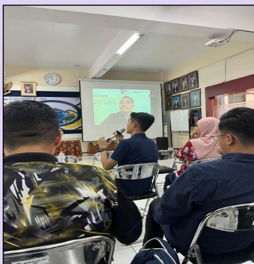
Engaging discussion during the course through virtual and in-person platforms