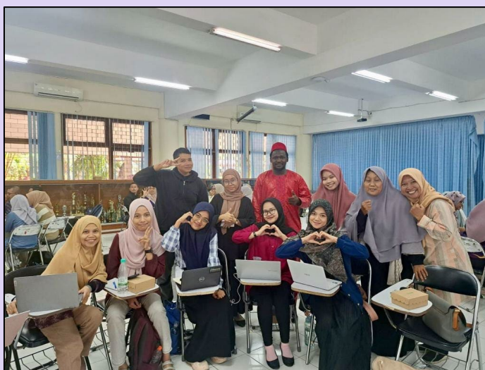
Group photo following the course's small group discussions

Newly emerging and re-emerging infectious viral diseases pose significant threats and challenges to the health sector today. Emerging Infectious Diseases (EIDs) are a particular concern for human health and global stability. Among these, vaccine-preventable diseases (VPDs) are caused by viruses or bacteria and can lead to infections that necessitate hospitalisation and, in some cases, result in fatal consequences. The best protection against VPDs is vaccination. Vaccines are one of the safest and most cost-effective health interventions available, offering numerous social and economic benefits. Moreover, vaccines can significantly reduce the incidence of VPDs , and in certain cases, help eliminate these health threats altogether. It is important to note that vaccines are not solely intended for children; adults also receive various types of vaccines to prevent specific diseases.