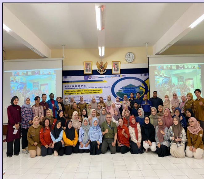
Bridging knowledge and innovation—an exciting collaboration between UiTM Pulau Pinang Branch and Universitas Airlangga (UNAIR)