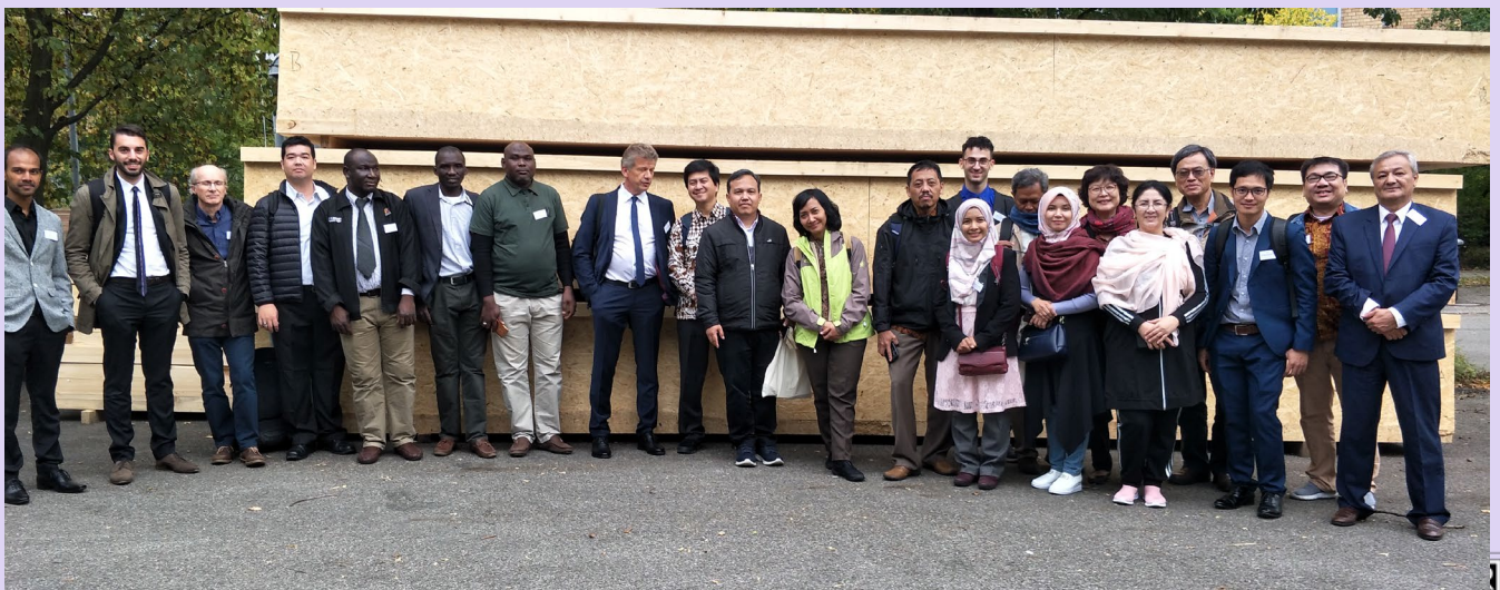
The international connection and collaboration were formed during a conference in Germany , leading to the signing of an MoU that was formalized today.