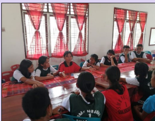
Participants were tasked with instructing SMK N1 Simanindo on the subject of public speaking and its proper execution.