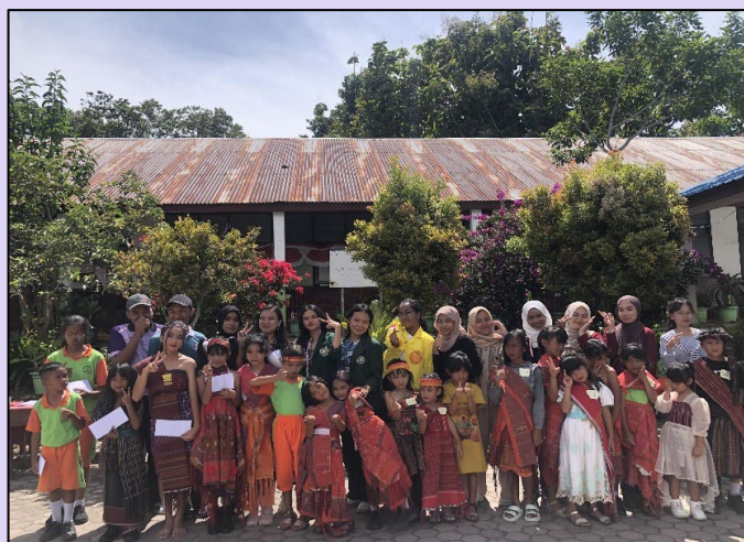
Fashion Show and Public Speech at Sekolah Dasar 25

The programme fosters genuine ties between international students and the local population, encouraging mutual tolerance, understanding, and appreciation for cultural diversity. Furthermore, by actively incorporating international students in the promotion of tourism and sustainable development, the programme helps to ensure the region's long-term socioeconomic progress.