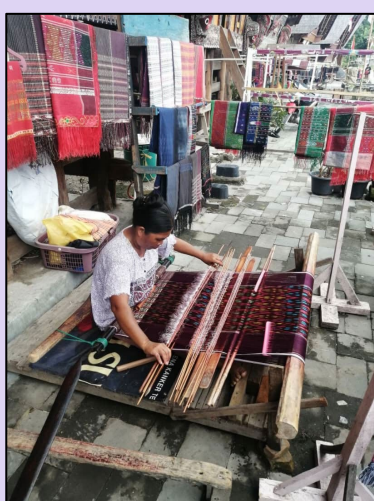
Batak's traditional costume, Ulos

Finally, Universitas Sumatera Utara's 2023 International Student Community Service Programme exemplifies the transformative impact of cross-cultural collaboration and service-oriented activities. Participants not only help Tuk Tuk Siadong Village grow via volunteer work, cultural exchange, and tourism promotion, but they also form lifetime connections and receive vital insights into Indonesian culture and tradition. As the globe grows more interconnected, programmes like this serve an important role in strengthening global citizenship and creating a more inclusive and sustainable future for everyone. This programme also were in line with the UiTM KPIs of PI 084, PI 010, PI 032, and PI 075.