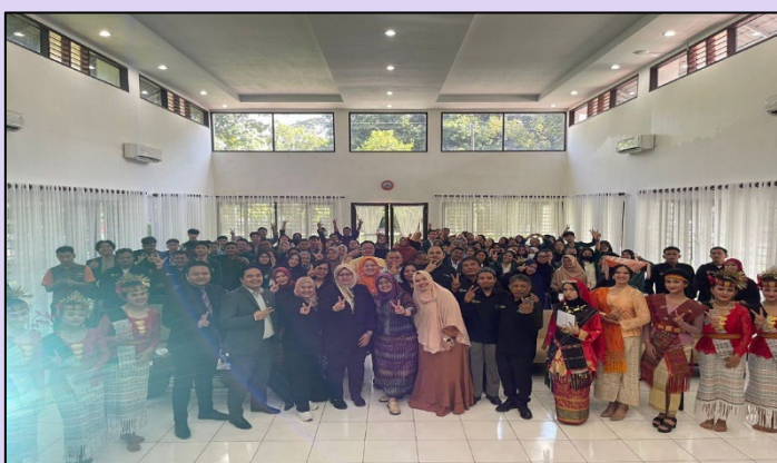
Participant with delegate members and dancers