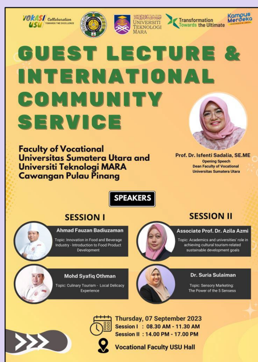
Poster of guest speaker and sessions