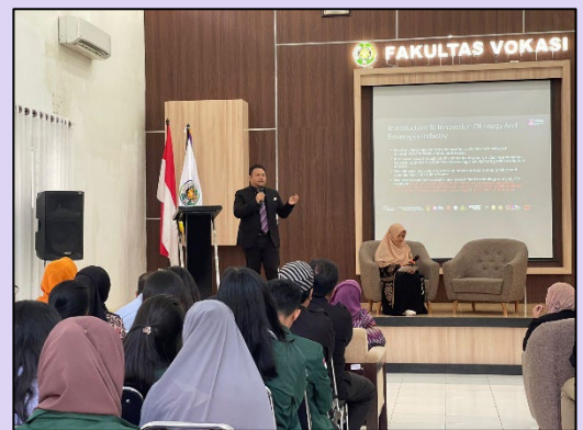
Speaker presentations and forum discussions