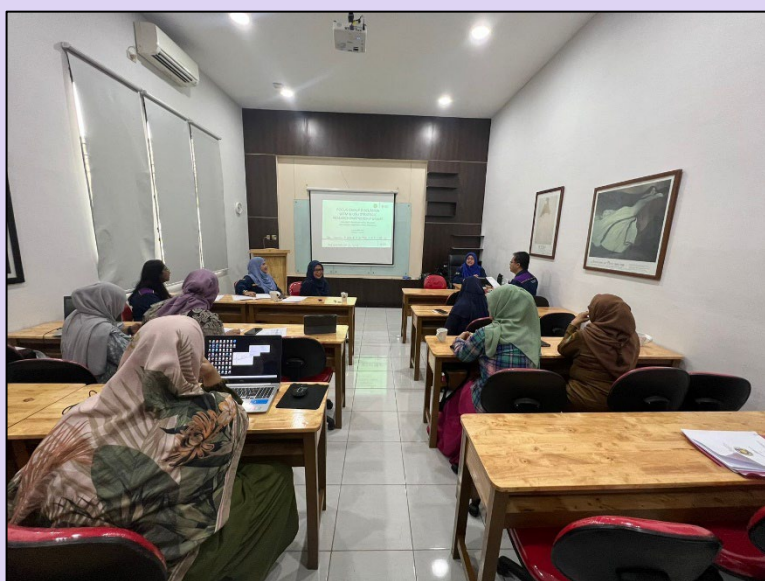
The briefing during the FGD session