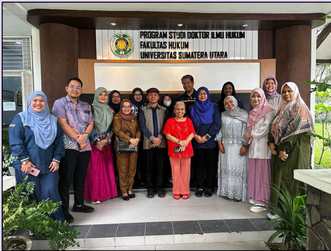
The participants of the FDG and UiTM-USU research team members