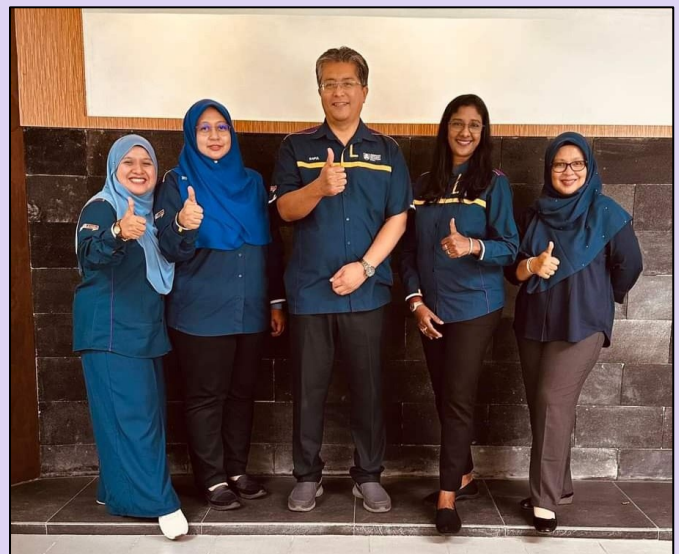
The UiTM SRP research team members