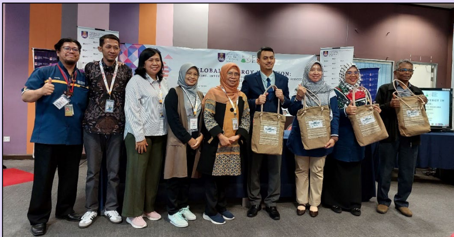
Gifts exchanges between UiTM and APDFI representatives.