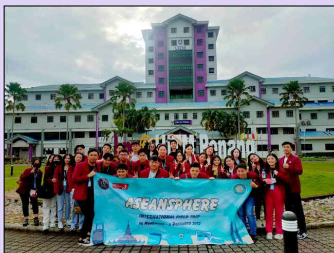
Delegation from Universitas Ciputra Surabaya, Indonesia in front of the main building of UiTM CPP

students' participation in international programmes), and PI84 (activities under MOA/MOU agreements).