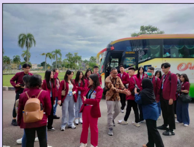
The arrival of UCS delegation at UiTM Pulau Pinang Branch

The International Field Trip Programme stands as a testament to the power of international collaboration in enriching educational experiences and fostering cross-cultural understanding among university students. As universities increasingly recognise the value of such initiatives, partnerships like the one between Universitas Ciputra Surabaya and UiTM Pulau Pinang Branch serve as exemplars of excellence in global education.