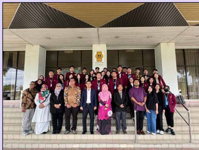
The top management of UiTM Pulau Pinang Branch and the delegation from Universitas Ciputra Surabaya, Indonesia

One of the objectives of the visit was to expand the international collaboration network between UiTM and UCS. This also fulfilled several UiTM performance indicators (PIs), such as PI7 (increasing the number of inbound students), PI23 (increasing collaborations with international higher education institutions), PI32 (increasing