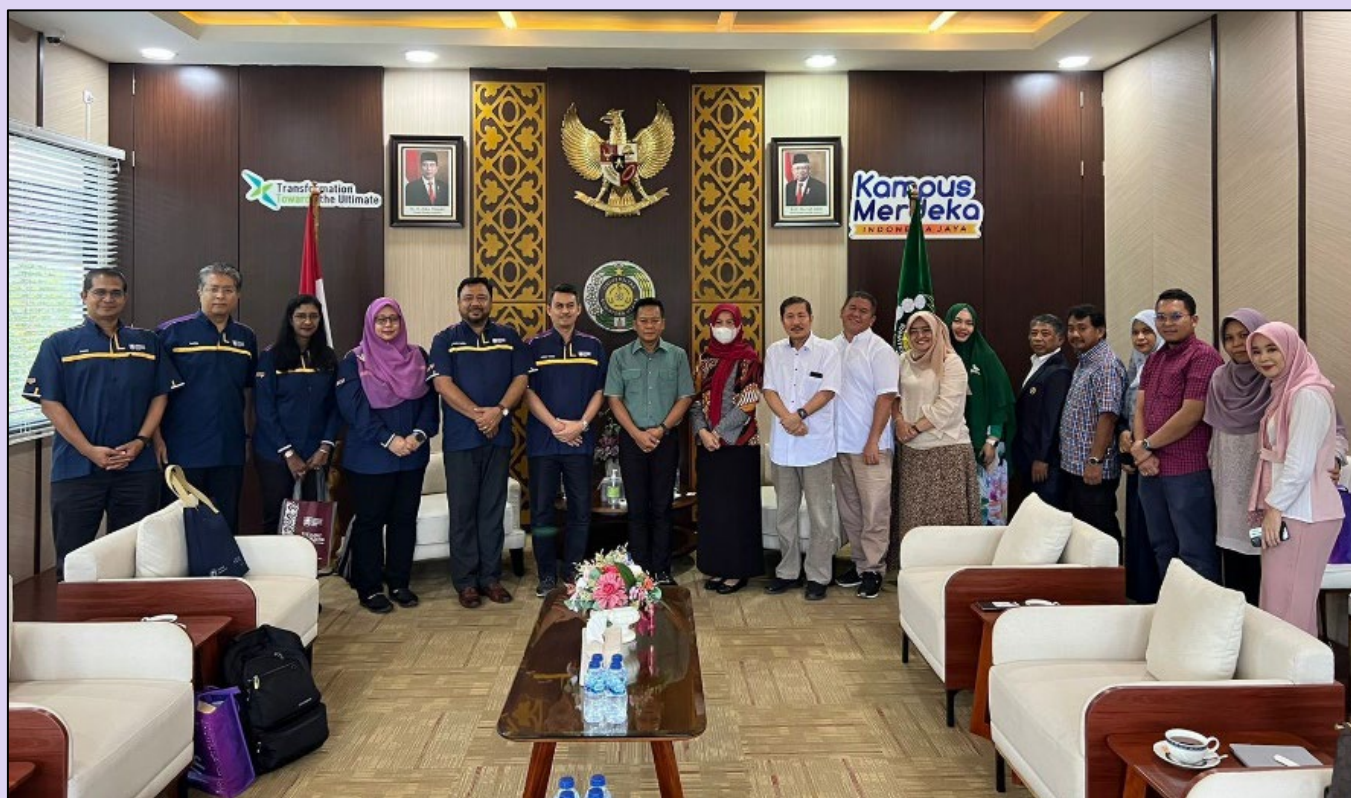
The UiTM Pulau Pinang Branch delegation with the USU Rector and Management Team