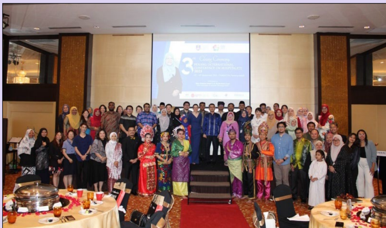
All participants enjoying the Malaysian traditional dance, sponsored by the Penang Convention and Exhibition Bureau (PCEB)