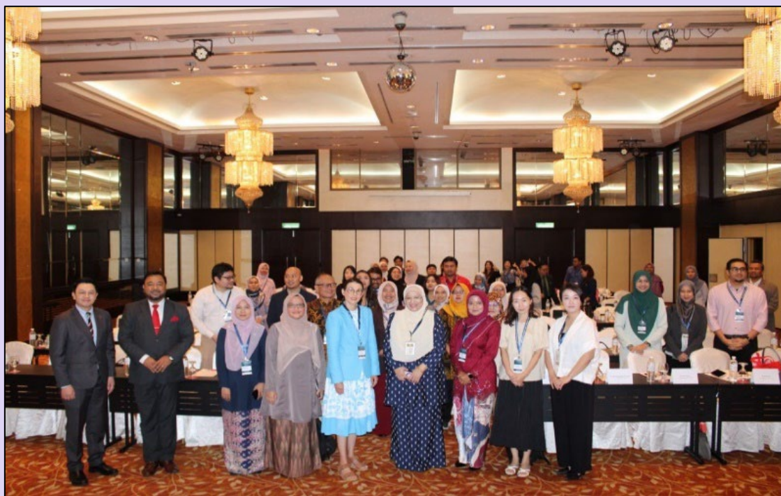
The keynote speaker, conference chair, conference co-chairs, and some of the conference participants during the official opening ceremony