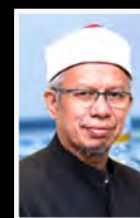
Dato' Seri Dr. Zulkifli Mohamad al-Bakri

(Petikan dari BAYAN LINNAS SIRI KE-193: BEKERJA SEBAGAI IBADAH: MENINGKATKAN SIKAP INTEGRITI)