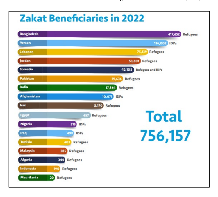
Fig. 2. Zakat Beneficiaries in 2022