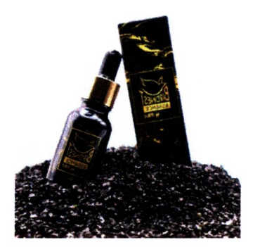
Birdnest Essence By PNA

One skincare product developed to improve the appearance of facial skin is essence. Additionally, it is slightly more concentrated than "toner" and has a viscosity or texture that is more liquid than serum. In essence, the essence is full of the vitamins, minerals, and antioxidants that the skin requires. advantages of face essence. is an essence that uses the minerals and vitamins it contains to nourish the facial skin. Due to its small molecule size, the essence can easily penetrate the inner layers of the skin. In order to improve the absorption of the serum and moisturizer which work on the inner layer of the skin essence should be "applied" prior to those products.