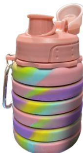
Figure 1.0 Foldable bottle with flavor straw

This Twist n' Taste 2-in-1 bottle is useful to help people minimize space. When empty, this water bottle shrinks to a small fraction of its original size, saving crucial space and making it more portable. For instance, it is easy for households to keep and organize these empty bottles on the kitchen shelves. Moreover, they are perfect for any activity such as outstation and traveling because they are lightweight and convenient to carry. This bottle is also helpful for those concerned with their health but occasionally need sweet drinks. This is because it has a straw that releases taste without adding sugar. Additionally, the flavored straws we use only contain an organic substance, so their use won't be harmful to consumers' health. Based on the survey that we have been conducting, 100% of respondents wanted a water bottle that is collapsible, equipped with a favorable straw sugar-free, and ensures proper hydration. Also, 96.8% of respondents state that this product might ease their daily activities and be more useful for them.