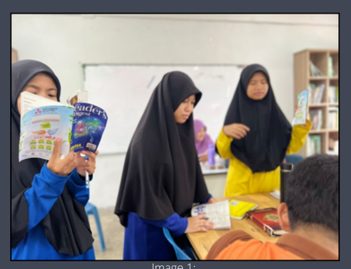
CReW RD (Creative Reading and Writing with Reader's Digest) program with Sekolah Menengah Agama Nilai, Negeri Sembilan.

This magazine also has unique features and articles that offer thought-provoking quotes and ideas to urge students to reflect on their beliefs and values. It also excels at telling stories that evoke empathy, whether they are about survival, a heartwarming act of kind-heartedness, or a personal journey of transformation. These stories frequently highlight the shared human experiences that transcend cultural boundaries, reminding us of our common humanity. By reading this magazine, students can develop the cognitive skills necessary for analysing information and making reasoned decisions, which are essential for navigating the complexities of today's society.