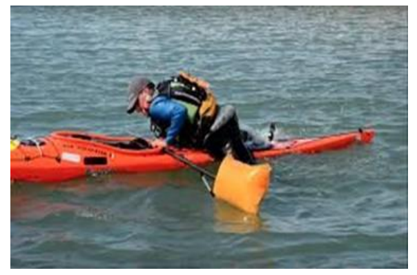
Figure 2: Cowboy re-entry

In an assisted rescue, where a companion is available, the process is faster and often easier. In this case, the assisting kayaker approaches the overturned kayak and positions its kayak alongside it. The rescuer can stabilize the overturned kayak by reaching across it and grabbing both sides of the cockpit. They then help the capsized O