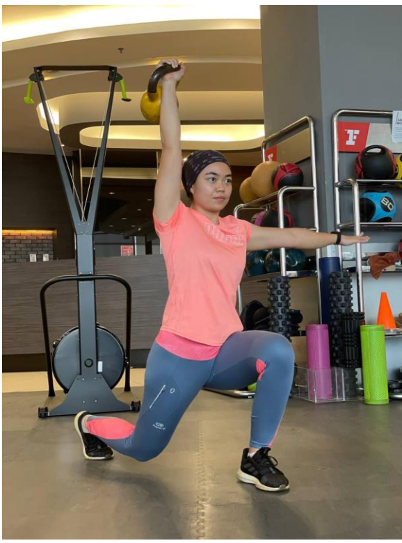
Performing lunges with kettlebell

The app boasts a vast exercise database, categorized for convenience. Users can explore a wide range of workout options, from strength training to cardio, stretching, and balance exercises. Each exercise is accompanied by clear instructions, step-by-step diagrams, and often, instructional videos to ensure proper form and technique [1].