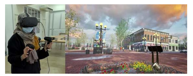
Figure 1 VR experiment session.

Open-ended questions during the interview explore the participant's virtual presence and the constructs of a virtual place experience from their real-time perspectives. The 'think aloud' method captures the real-time participant feedback as they navigate through the VE, providing insights into the elements that constitute a sense of place in a virtual place setting.