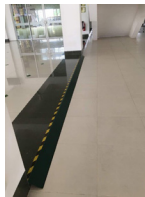
Figure 4: Threshold is levelled with step ramp