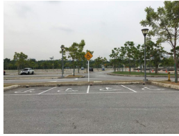
Figure 1: Disable parking