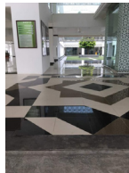
Figure 9: slippery floor tiles at the prayer hall