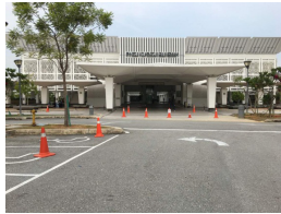
Figure 2: Disable parking route to the main entrance