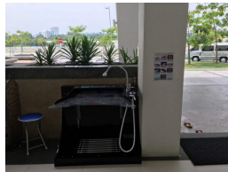
Figure 8: Ablution installation