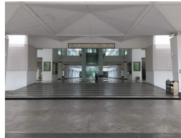
Figure 5: main entrance with slippery tiles