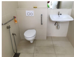
Figure 10: Disable toilet