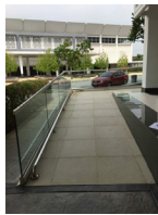
Figure 3: Ramp with one side handrail with existing height is 390 mm