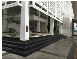
Figure 6: Stairs with no tack tiles and handrail