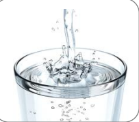
Uncap top part for drinking water compartment