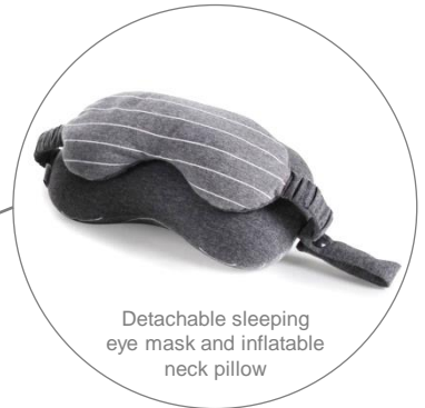
Detachable sleeping eye mask and inflatable neck pillow

It is easy to fold, store and carry around in