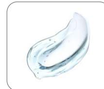
Uncap bottom part for gel hand sanitizer compartment