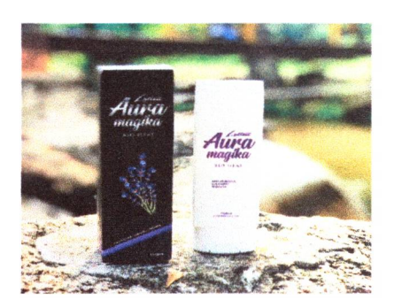
( Aura Magika Lotion)

First of all, the reason I chose to be an Aura Magika agent was because I wanted to build a business empire to empower the religious and national economy. I was introduced to this business by my friend. Since this is my first time in this business field, there are many things that I need to learned regarding this business. For instance, I have no knowledge of how to start this business properly and my level of confident in getting customers to buy the product was a bit doubtful. Eventually with guidance from my friend, I manage to build up confident and knowledge on how to run the business.