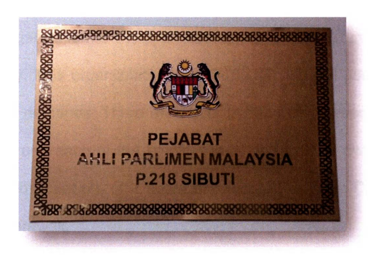
Figure 1.1: The organization's signboard