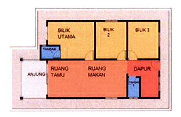
Figure 3.1: House with space of 866kps

introduced by the government in helping the poor to have their own house. This programme is eligible to be applied by family that have income below RM1500 a month and does not have a house to live but have a land that can be used for building without restrictions from other parties. Below are the pictures of the house: