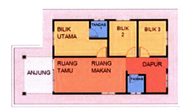
Figure 3.2: House with space of 700kps