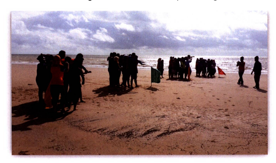
Picture 10: Photo during Sibuti's Youth Camp at Bungai Beach, Sibuti