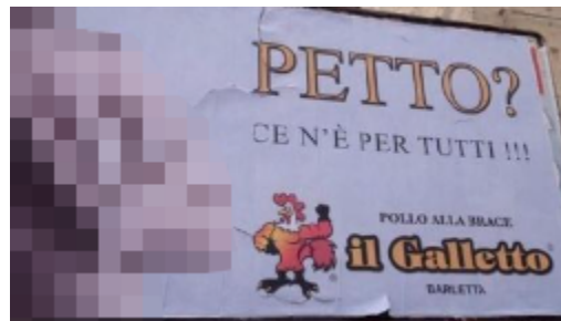
Figure 4. It illustrates an ad for a restaurant Il Galletto , displayed in Barletta, Italy, in 2020.

further engage the audience. The perpetuation of such imagery not only reinforces harmful gender stereotypes but also highlights the pressing need for a critical reassessment of ethics within the advertising industry. Despite concerted efforts by various organisations and individuals committed to protecting women's dignity, endeavours to eliminate sexist and vulgar billboards and television advertisements have largely been unsuccessful (see Rochefort, 2022). These promotions persist and flourish, eluding removal or censorship (Landoni, 2023). Even advertising disseminated through social media channels is steeped in sexism and the nudity of the female form. Indeed, female influencers resort to these elements because they constitute two winning components that ensure a successful strategy (Besso, 2023).