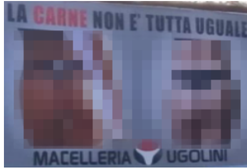
Figure 6. It depicts a billboard erected in Misano Adriatico, Italy, in 2022.