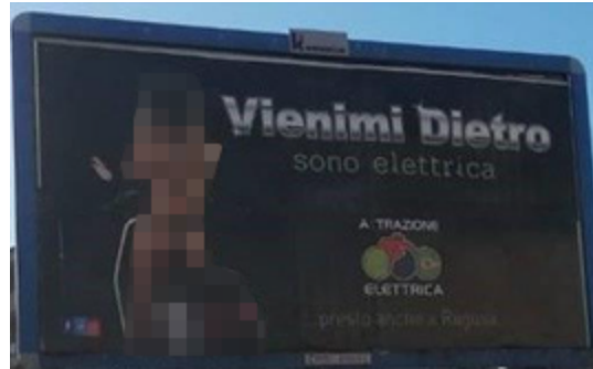
Figure 8. It depicts a 2022 advertisement for electric scooters, in Ragusa, Italy.