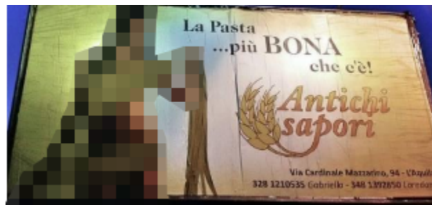
Figure 5. It showcases an advertisement for the pasta brand Antichi Sapori , displayed in the city of L'Aquila in 2021

The term petto carries a dual meaning, referring both to “filet chicken” and “woman’s breast”. In this context, the advertisement inevitably assumes a sexual connotation. This billboard, featuring a semi-nude woman, has sparked considerable debate. The Imola City Council has publicly condemned the advertisement, arguing that it does not align with the values of civility and respect for women. Nonetheless, it is also evident that content with double meanings, even if vulgar, generates discussion, which is a fundamental advertising objective: to provoke public discourse.