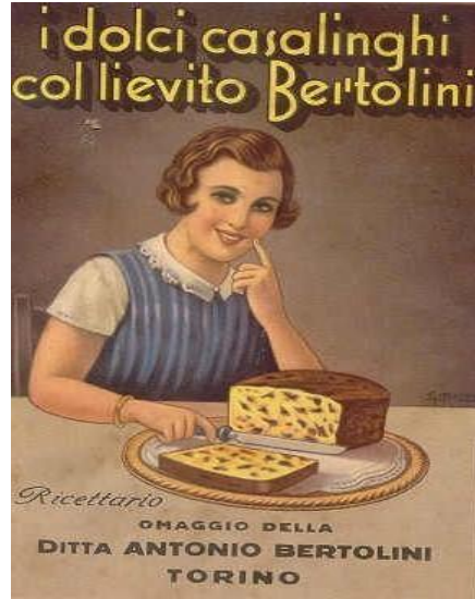
Figure 2. It depicts a 1960s advertisement showcasing the idealised and stereotypical portrayal of a woman preparing a cake.