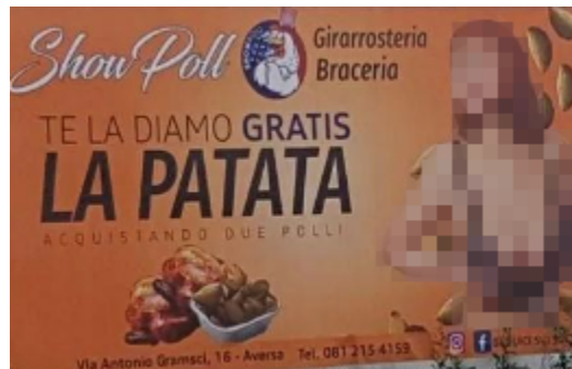
Figure 7. It depicts a 2021 sexist advertisement for a rotisserie in Aversa, Italy.

The proprietor of Butcher Shop Ugolini created and erected a billboard featuring two female buttocks: one youthful and toned, the other slightly more mature with visible cellulite. The advertisement emphasises that “meat is not all the same”, with CARNE translating to “meat” in Italian. The image circulated widely on social media, sparking numerous protests, ultimately leading the proprietor to remove it after one year. This type of advertising is not only offensive to women but also sets a poor example for young people. These gender stereotypes, described by some as humorous, are not only in poor taste but also deeply offensive and vulgar, and should therefore be censored.