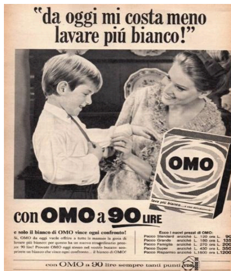
Figure 1. It illustrates a 1950s advertisement portraying a woman tending to her child's clothing and engaging in household chores, reflecting the societal expectations of women's roles during that era in Italy.

Italian advertising has garnered a longstanding reputation for its frequent utilisation of erotic and sexist imagery, particularly in its portrayal of women, across diverse mediums such as television, billboards, and radio. This trend, which gained momentum in the 1970s and persists in various iterations today, underscores complex interactions among historical, cultural, and socioeconomic elements within Italy (Eos, 2023). During the 1950s and 1960s, women were consistently depicted as subservient to men in Italian advertising, reflecting the prevailing patriarchal norms of the time. Such depictions mirrored the societal framework where men held authoritative positions within the family unit, while women were predominantly confined to domestic roles and had limited involvement in the workforce beyond familial boundaries (Burei, 2021).