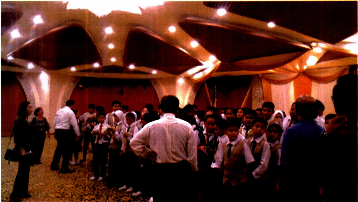
Receiving DUNS visit from the local schools and bring them around the buildings.