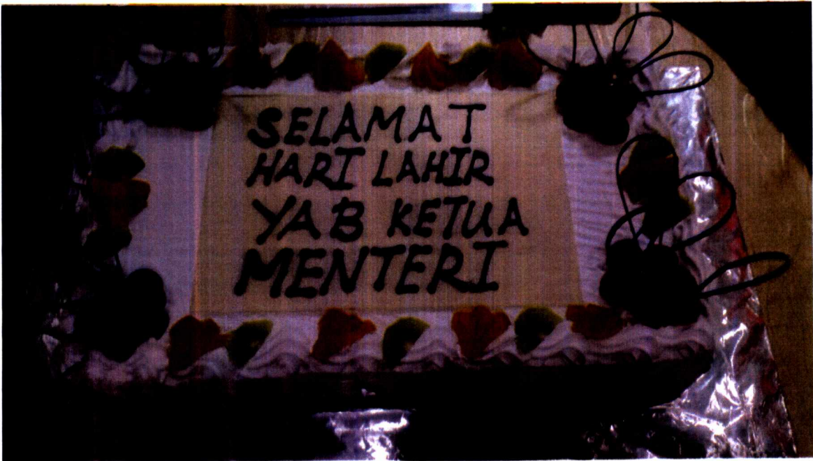
The Public Relations Department event in giving the surprise to Sarawak Chief Minister.