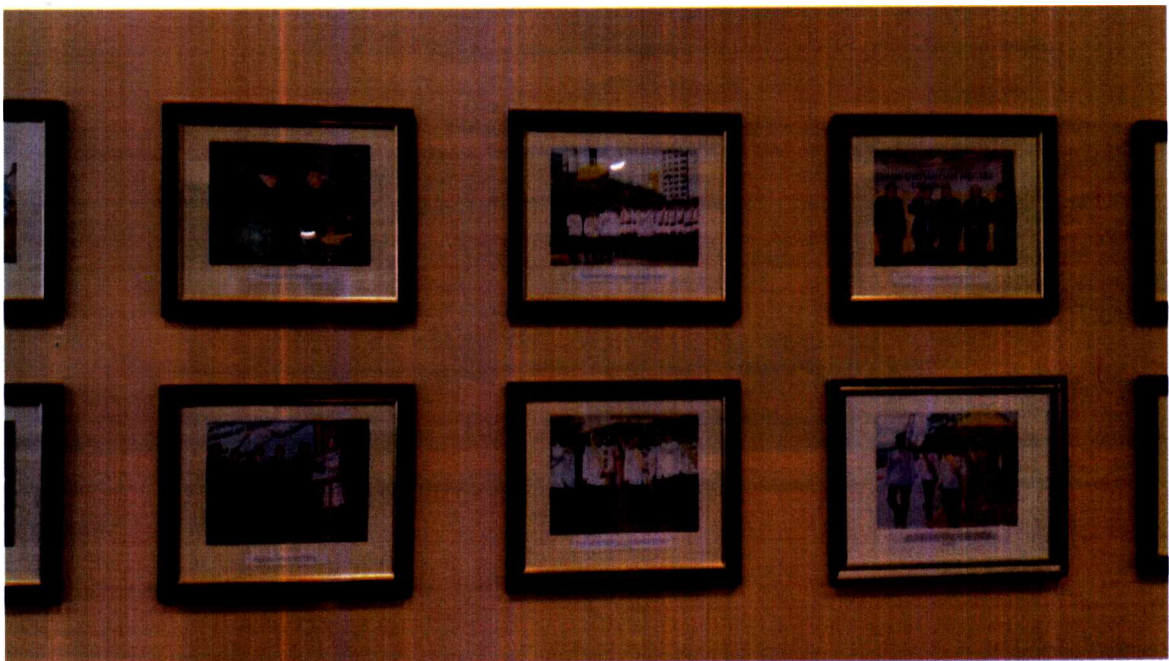
Do the tagging at pictorial public gallery.