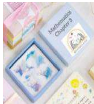
3.2 Box type of packaging