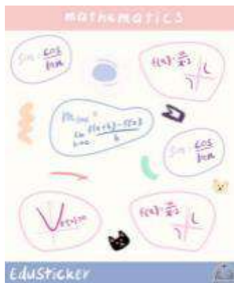
3.1 Sheet of sticker packaging

The novelty of the eduSTICK can be fold in several usefulness. The first study tools company to launch stickers that are focus on key points and formula for a certain subject. Secondly, can help students who prefer using graphic to understand more about a certain topic. Moreover, students can easily apply eduSTICK by focusing on what type of formula or keywords that are related to the question or topic that they are learning. Lastly, the sticker comes in three types of packaging which is sheets of sticker for sticker based on topic, box of sticker for based on chapter and lastly booklet packaging for sticker based on subject.