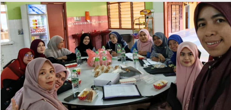
Pogramme of Sahabat UMI