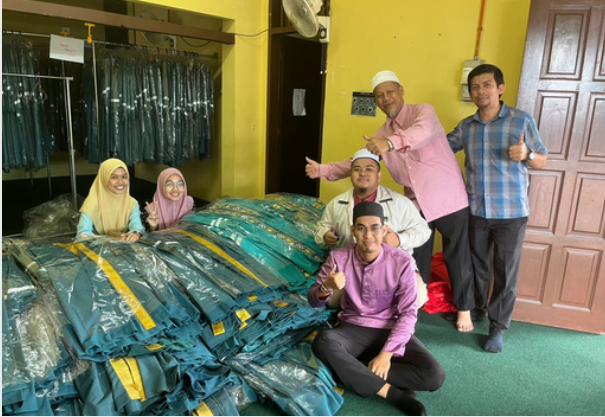
On duty at robe room