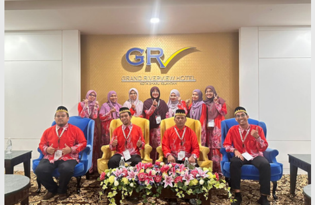
KIAS convocation ceremony