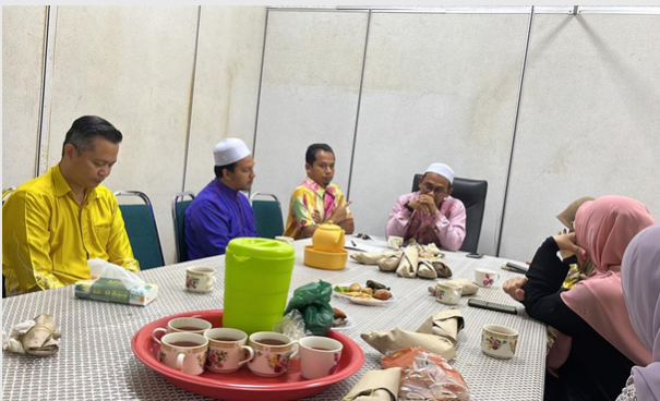
Weekly 'usrah' at HEPA's meeting room