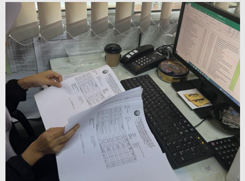
Doing work at office