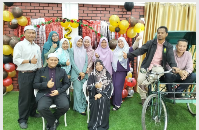
Event of 'Amanat Rektor'