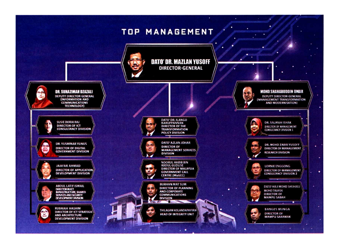
Picture 1: Organisational Chart of MAMPU Top Management as at December 10, 2018