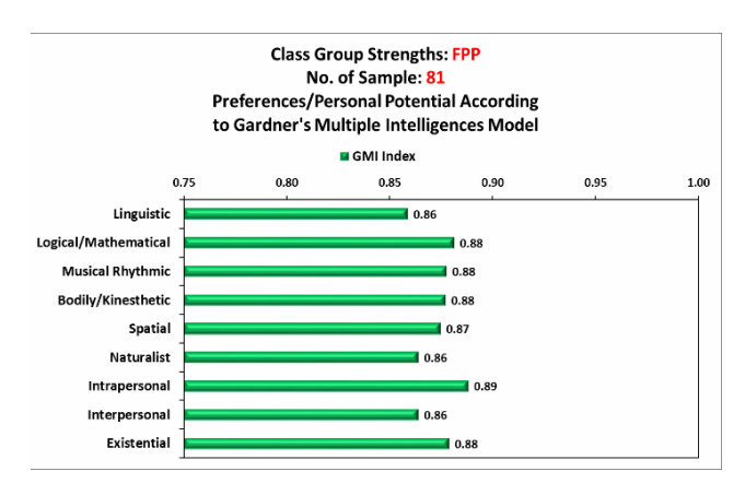
Fig.1 Preferences/personal potential of FPP