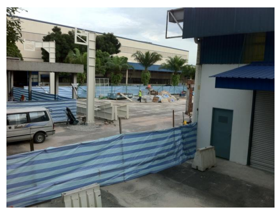
Figure 1: Construction site for this study

Table 1: Statistics of number of industrial de aths by Department of Occupational Safety and Health, Ministry of Human Resources, Malaysia