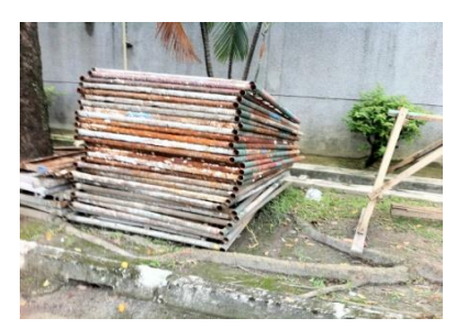
(a) Scaffolds are not properly stored

The intervals in turn are dependent upon the nature of the critical components of the crane and the degree of their exposure to wear and deterioration.