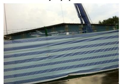
(d) Not a proper fence

Figure 3: Potential hazards observed at the construction site