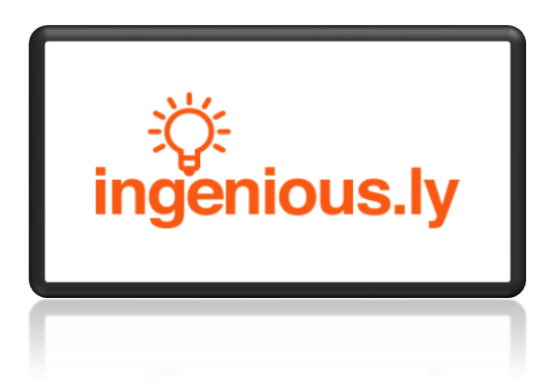
Figure 1.1: Logo Ingenious.ly Sdn. Bhd.