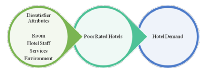
Figure 1: The Conceptual Framework of the Research

dissatisfaction of customers in their experience with the hotel. The dependent variables are to show the relationship between hotel ratings and hotel reservation.