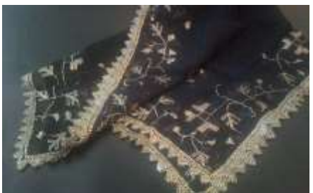
Figure 3. Selayah