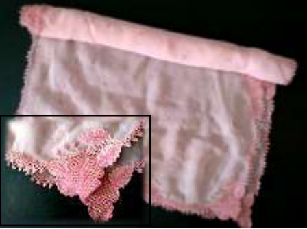
Figure 6. Thread embroidery shawl worn by women in 60s and 70s.