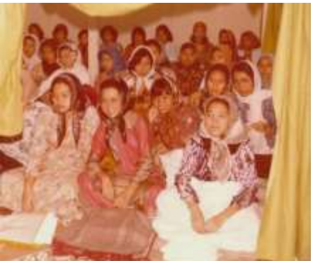
Figure 5. Scarf worn by women in 60s and 70s.

Weaver B also exhibited another type of thread embroidery shawl worn by women in the 60s and 70s as shown in Figure 6. This shawl is considered as a fashionable option of headscarf traditionally worn by the Sarawakian women in the past. This 0.5m x 17m shawl proves the embroidery skills of the weaver. Note that the weavers in the past used the manual foot or hand press Singer's sewing machine for their embroidery works. Thus, intense sewing and embroidery skills are required to produce a quality headscarf as shown in Figure 6. This type of shawl is found rarely worn by women nowadays.