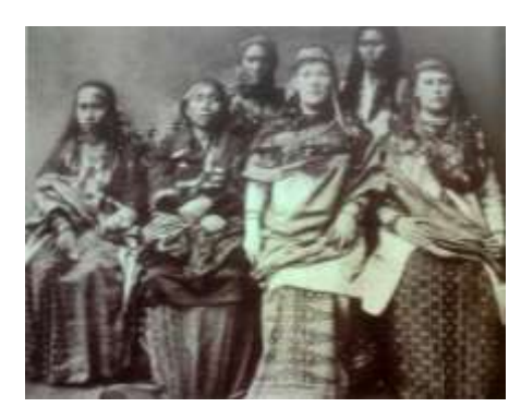
Figure 1. Ranee Margaret Brooke (second from right) wearing the Sarawak Malay women costume ( Brooke, 1913, pp. 156 )

Renee described how, "...A gauzy scarf of white and gold, obtained from Mecca, covered my head, and a wide wrap of green silk and gold brocade was flung over the left shoulder ready to cover my head and face when wearing the dress in my walks abroad." (Brooke, 1913, pp. 27). The stories of the Rajah's lady and royal ladies of the Brunei Sultanate wearing golden ornaments mixed with Selayah have lifted up the image, status and luxurious values of Keringkam (Abang Josmani et al., 2012). The Selayah Keringkam brings a priceless sentimental value which is regarded as a family's heirloom inherited to the next generation. Basically, the Selayah Keringkam is a part of traditional Sarawak's Malay woman suit worn with the embroidered Baju Kurung Songket and the additional piece of Songket (embroidery skirt) hang cross over the shoulder to the side of the body like a jacket, shown in Figure 2.