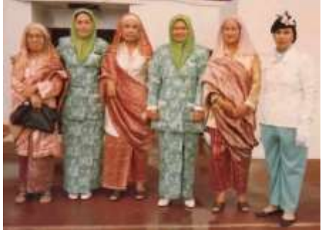
Figure 2. A complete traditional Sarawak Malay woman suit.