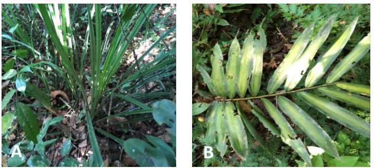
Figure 1. Plants selected for the present study. (A) Pandanus sp., (B) Alpinia sp.

This study was carried to isolate and identification of endophytic fungi from Reserve Forest of Universiti Teknologi MARA, Cawangan Negeri Sembilan. The plant tissues specially leaves and stems are excellent reservoirs for endophytic fungi. About twenty-four leaves sample (twelve samples of each species respectively) of the Pandanus sp. and Alpinia sp. were screened for the isolation of the endophytic fungi (Figure 1). A total of three endophytic fungi was isolated and identified from both medicinal plants. The leaf samples from Pandanus sp. showed a maximum repository for endophytic fungi than the Alpinia sp. Among the three endophytic fungi, one unidentified isolate (P2) was group to Zygomycota phylum. Other two isolates were identified as species belong to Lentinus sp. (A1) and Colleotrichum sp. (P1). These results were similar with Meifei et al. (2013), who isolated belongs to Fusarium, Xylaria, Pestalotiopsis, Aspergillus, Nigrospora, Stachybotrys, Rhizoctonia , and Macrophomina in 500 sample of leaves of Pandanus sp. Li et al. (2011) also found a various endophytic fungus in Alpinia officinarum including Pestalotiopsis, Sebacina, Penicillium, Marasmius, Fusarium, Exserohilum, Mycoleptodiscus, Colletotrichum, Meyerozyma , and Scopulariopsis .