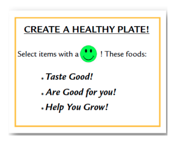
Figure 4: The green emoji sign placed in cafeteria

The same situation happens in Frederick Douglass Elementary School (FD) of the Cincinnati Public Schools. Green smiley face intervenes to encourage children to purchase healthy food such as grain, fruits, vegetables, and plain white fat-free milk in the cafeteria. The sign of green emoji placed next to this vegetable, fruit, plain white fat-free milk, and the entrée to encourage smart food selection and also increase the rate of purchase (Siegel et. al, 2015). As a result, the purchases of the plain white fat-free milk were increased rather than flavoured chocolate milk (Siegel et. al, 2015). From the result, it proved that green emoji was able to influence the rate of food purchases and also food selection among children. Without any explanation, the smile expression might give cues and convince them to choose healthy foods. Consequently, applying emoji in the awareness campaign was very effective, low cost and relevant to the target such as children (Siegel et. al, 2015).