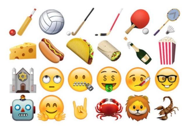
Figure 3: Examples of emoji

Emoticons became popular and the consequences of its demand, emoticons were modified to turn to be emoji (Davis & Edberg, 2016). The Japanese interface designer, Shigetaka Kurita was the responsible person inventing the old emoticons into the new emoji according to his company's request. Moreover, the emoji was developed for the purpose improving text communication that lacked emotions (Golden, 2015).