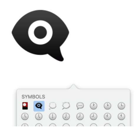
Figure 5: The eye emoji for preventing bully

communication but more to awareness campaign in supporting anti-bully (Clover, 2015; Miller, 2015). The purpose of this campaign is to inspire teenagers to be brave to make a report if they are bullied or seen other people been bullied (Miller, 2015). This campaign is strongly supported by other giant companies like Adobe, Google, Twitter, Facebook, and Youtube. They suit the eye emoji from Apple into their platform as a supporting move. Users can use this emoji to remind a bully to stop.