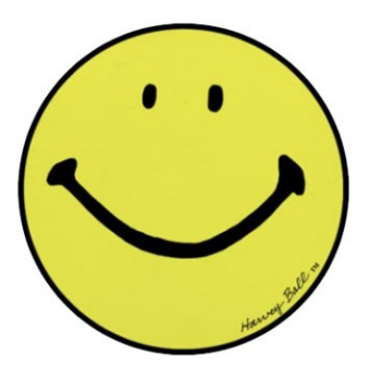
Figure 1: First smiley symbol sketched by Harvey Ball

The emoticon terminology actually came from the combination of two English words; emotion and icon (Tomic et al., 2013). According to the National Telegraphic Review and Operators Guide in 1857, a painter known as Morse contributed an invention of the telegraph system. Based on the Morse code, the number '73' gave meaning as best regard meanwhile the number '88' means love and kisses. Subsequently, in the year 1881, Ambrose Bierce introduced laugh emoticon \____/. This expression consists of a few punctuation marks and published in Puck magazine in the United State. According to Tomic et al. (2013), that symbol also represents smile expression. In 1963, an artist called Harvey Ball created a new smiley symbol. The symbol was yellow color button completed with two black dots as eye and black curve as a mouth. Here was the starting point of the smiley addict and later it was upgraded as emoticon (Tomic et al., 2013).