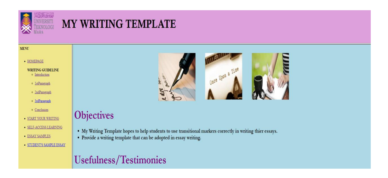
Figure 1. The Home page of the Writing Generator

The corpus of this study was 45 essays written by students. These 45 essays comprised 15 written by students before they were introduced to the use of Writing Generator (pre-test), 15 after the use of the Writing Generator (post-test) and another 15 a month later without using the Writing Generator (delayed post-test). The essays were based on three similar titles from an English writing class. This similarity was our first criterion for the selection of the essays. All essays were produced in classes taught by the same teacher. The instrumentation of the study is based on Harris's (2013) and Dafouz-Milne (2008) classification of transitional markers. Then they were put into nine categories, namely the categories of addition, comparison & similarity, contrast, time, purpose, result, place, example and summary & emphasis (see Table 1). Lastly, the essays were examined to determine the frequency of the TMs. An attempt to analyse the differences between the uses of TMs in the pre-test, post-test and delayed post-test is then made. Thus, the study is guided by the following research questions: