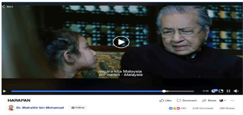
Image 2: A clip from Dr. Mahathir's 10 minutes short film titled 'Harapan' (the image was captured on April 31st, 2018 at 10.20 am)