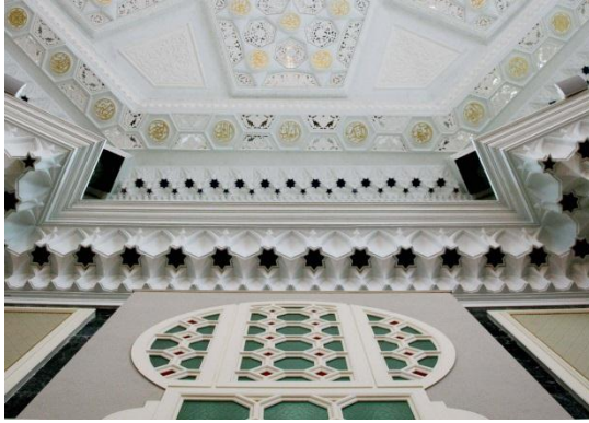
Figure 2: Fine Art Architectural Photography I