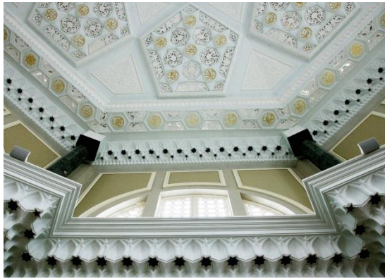
Figure 3: Fine Art Architectural Photography II