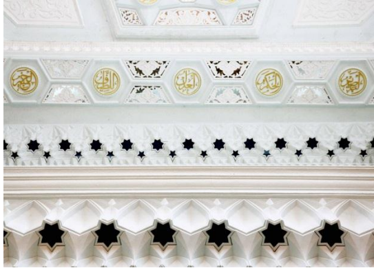
Figure 4: Fine Art Architectural Photography III