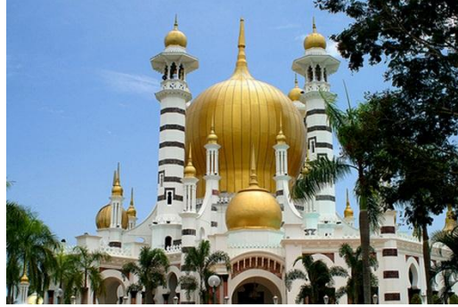
Figure 1: Masjid Ubudiah in Kuala Kangsar