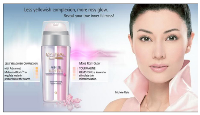
Figure 2 : White Perfect Transparent Rosy Whitening by Lóreal Source: Lóreal. (2013, March). [Advertisement for White Perfect Transparent Rosy Whitening]. Cleo, (209).