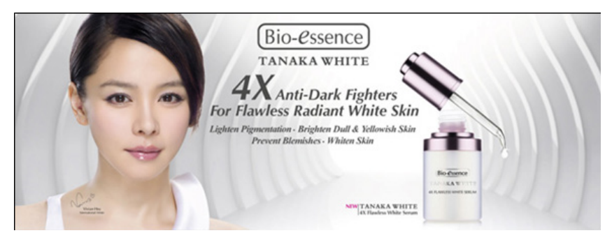
Figure 3 : Tanaka White by Bio-essence