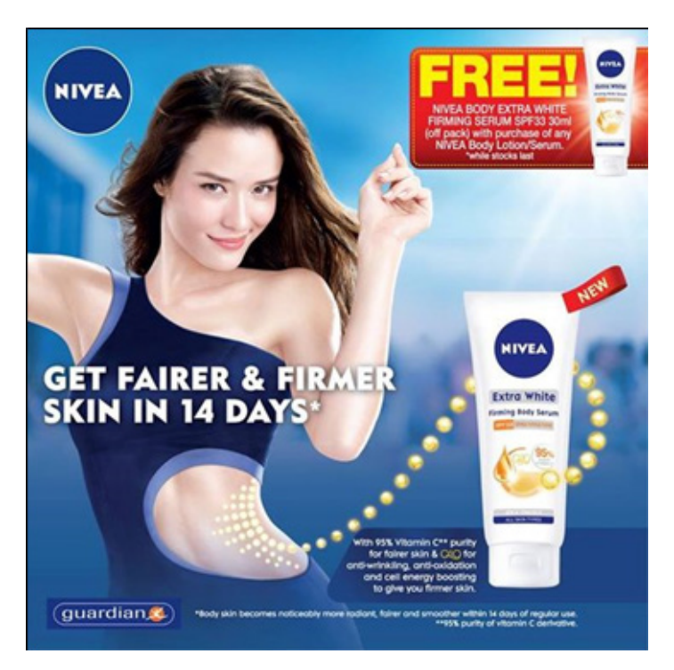
Figure 4: Extra White Firming Body Serum SPF 33 by Nivea Source: Nivea. (2015, August). [Advertisement for Extra White Firming Body Serum SPF 33]. Female.