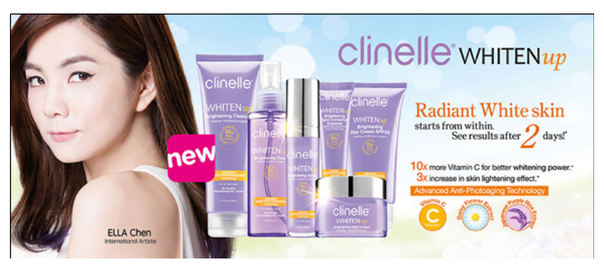
Figure 6: Whiten Up by Clinelle