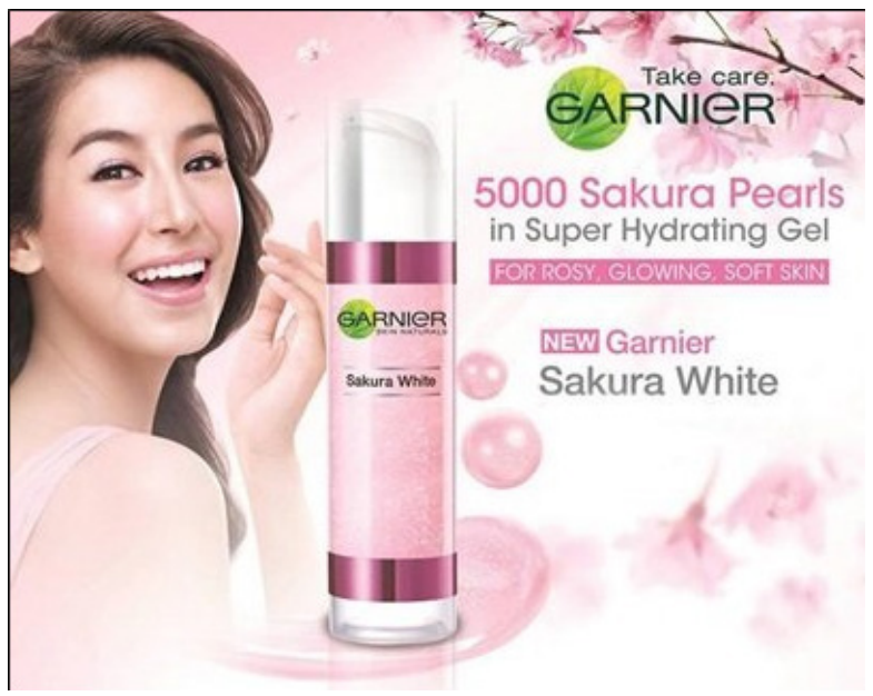
Figure 5 : Sakura White by Garnier